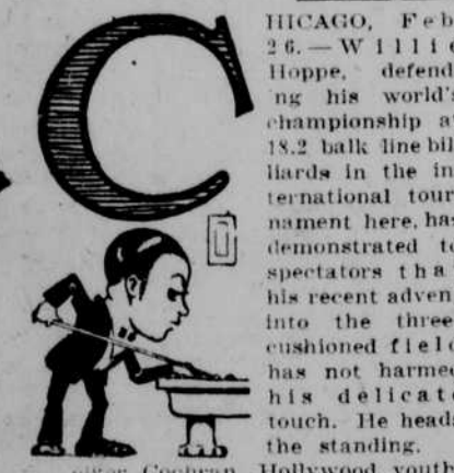
HicAGO, Feb. 26