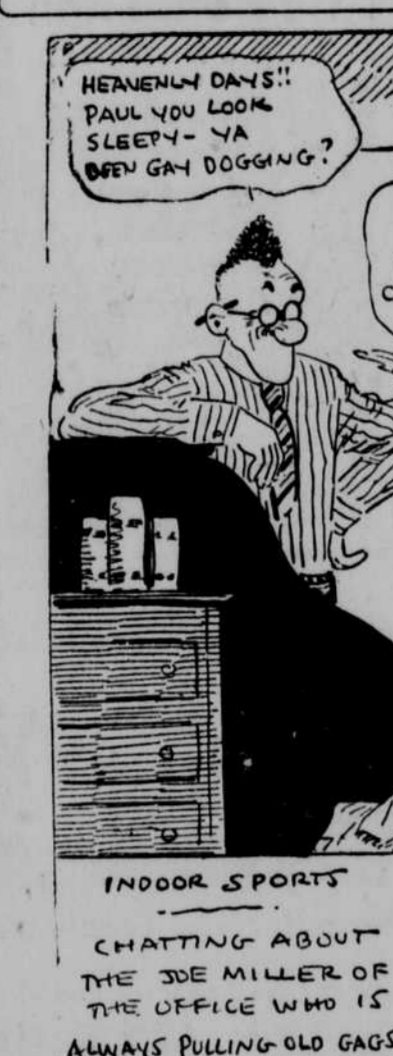
INDOOR SPORTS CHATTING ABOUT THE JOE MILLER OF THE OFFICE WHO IS ALWAYS PULLING OLD GAGS