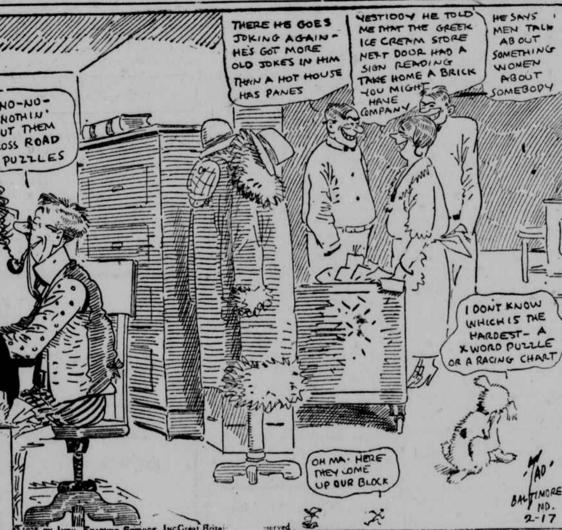
INDOOR SPORTS CHATTING ABOUT THE JOE MILLER OF THE OFFICE WHO IS ALWAYS PULLING OLD GAGS