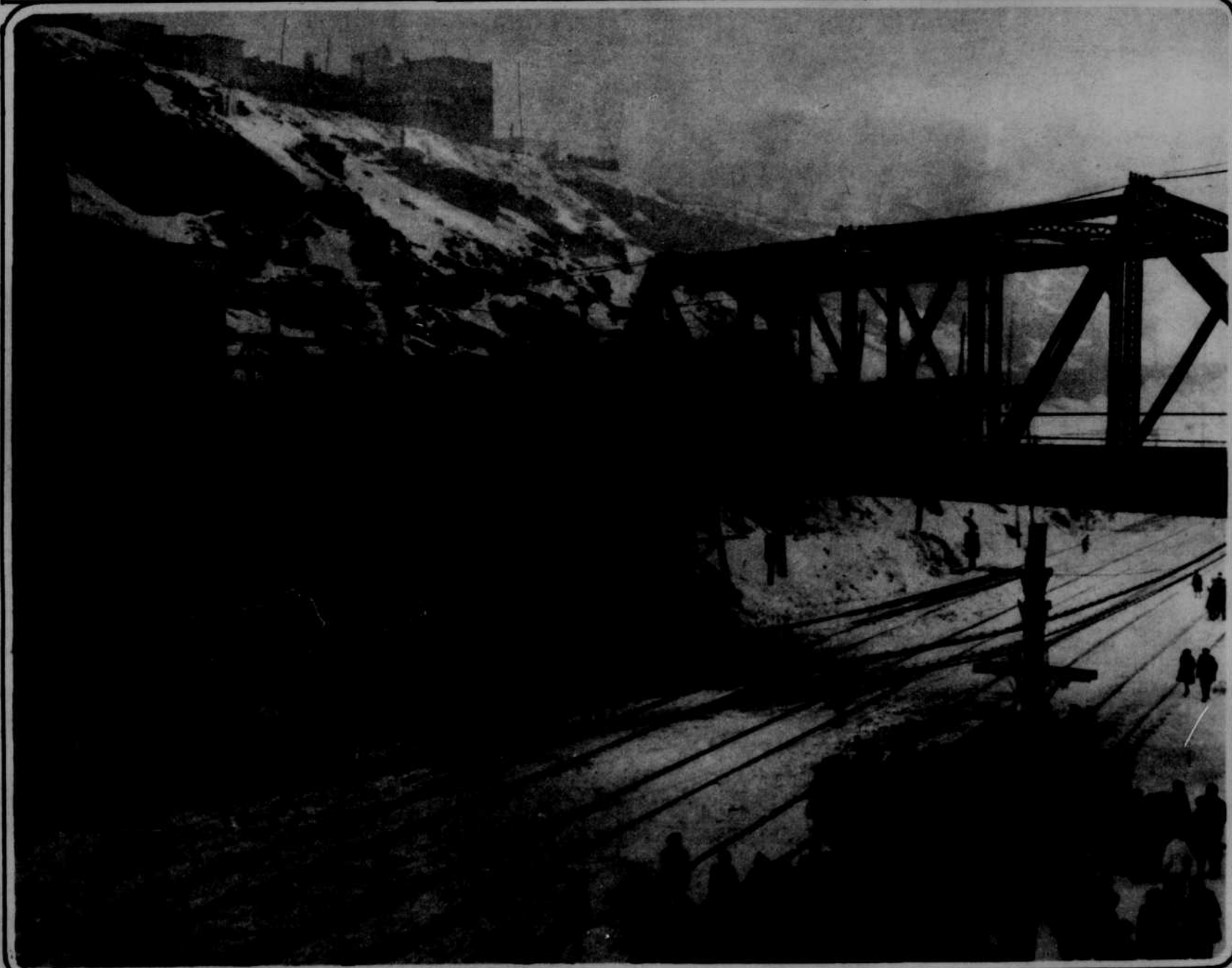
Twenty-four persons, including the motorman, are reported to have been injured, one seriously, when a Jersey City, Hoboken, and Paterson division Public Service trolley car plunged off a trestle onto the tracks of the West Shore Railroad at Marshall St., near the Hoboken city line.