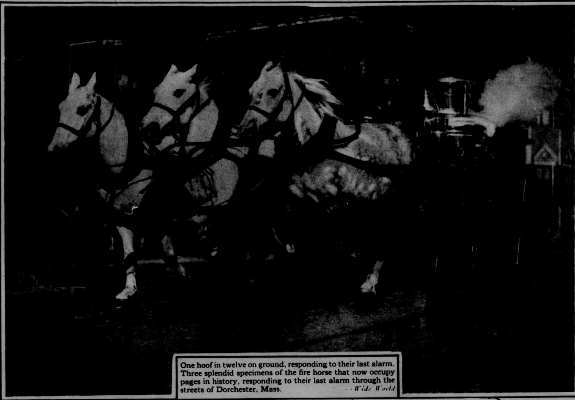
One hoof in twelve on ground, responding to their last alarm. Three splendid specimens of the fire horse that now occupy pages in history, responding to their last alarm through the streets of Dorchester, Mass.