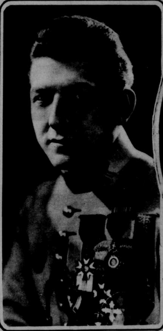
Captain Charles Nungesser, greatest living French "Ace" who was woundedsevententimes in action and who was honored by all of the Allied powers that participated in the World War. Captain Nungesser has just come to the United States to star in motion picture, "The Sky Raider".