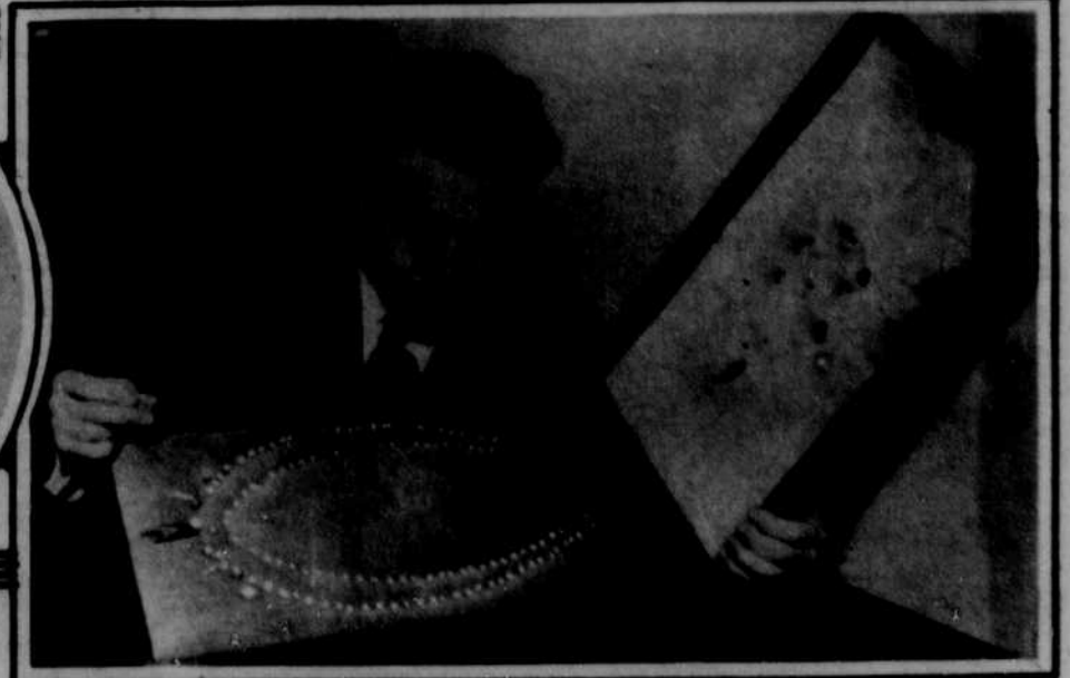
World's oldest necklace believed to be 75,000 years old being shown at the Chicago Art Institute.