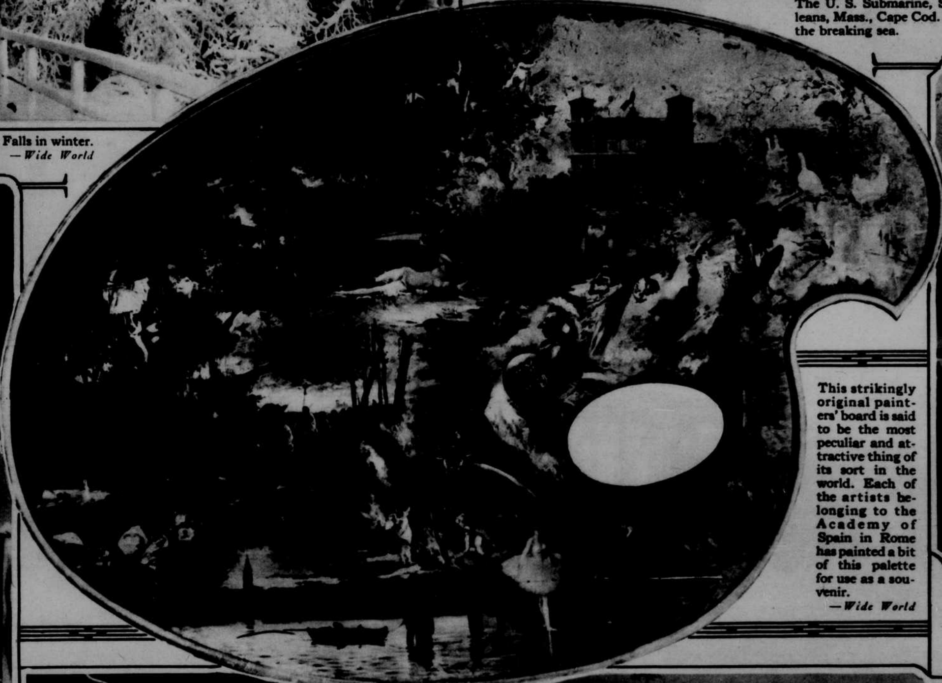
This strikingly original painters' board is said to be the most peculiar and attractive thing of its sort in the world. Each of the artists belonging to the Academy of Spain in Rome has painted a bit of this palette for use as a souvenir.