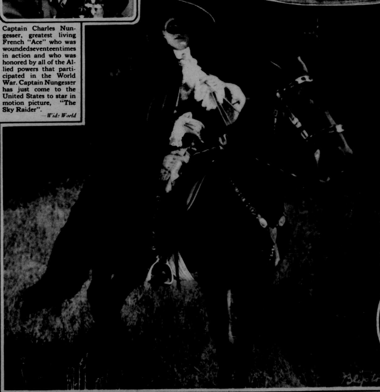
The mask of this dangerous rogue hides the face of Tom Mix, the famous star of the Fox Studios. As "Dick Turpin", the dashing and witty coach robber of England Tom has the greatest role of his career. William Fox promises an early showing in New York.