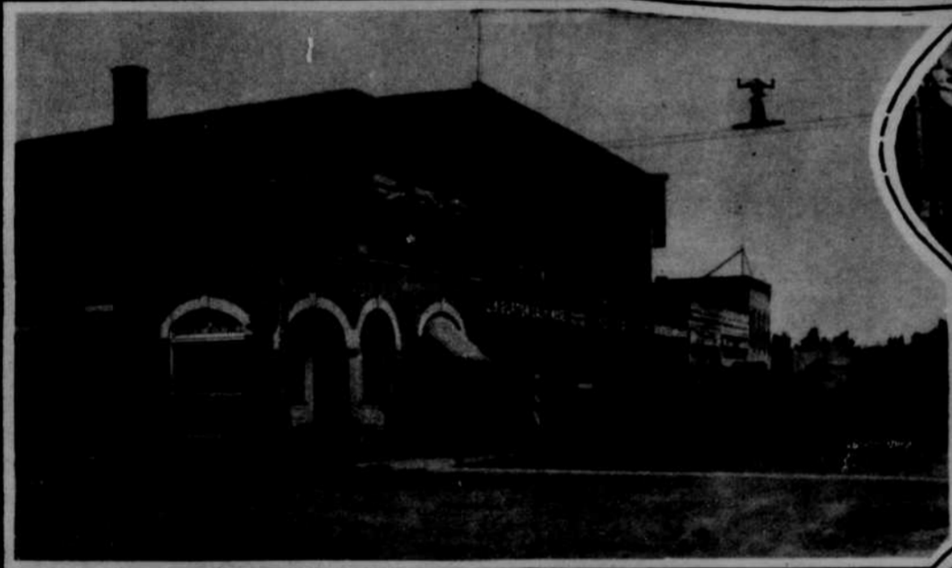
A corner in Oxford.