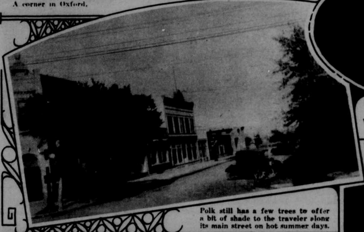
Polk still has a few trees to offer a bit of shade to the traveler along its main street on hot summer days.