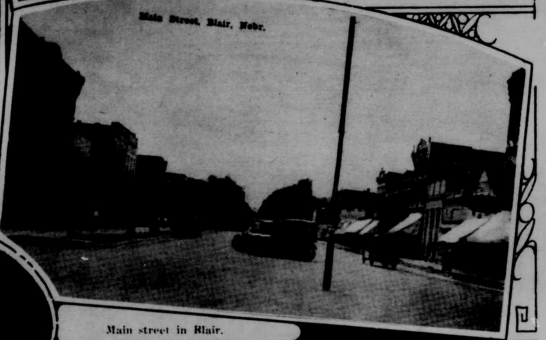
Main street in Blair.