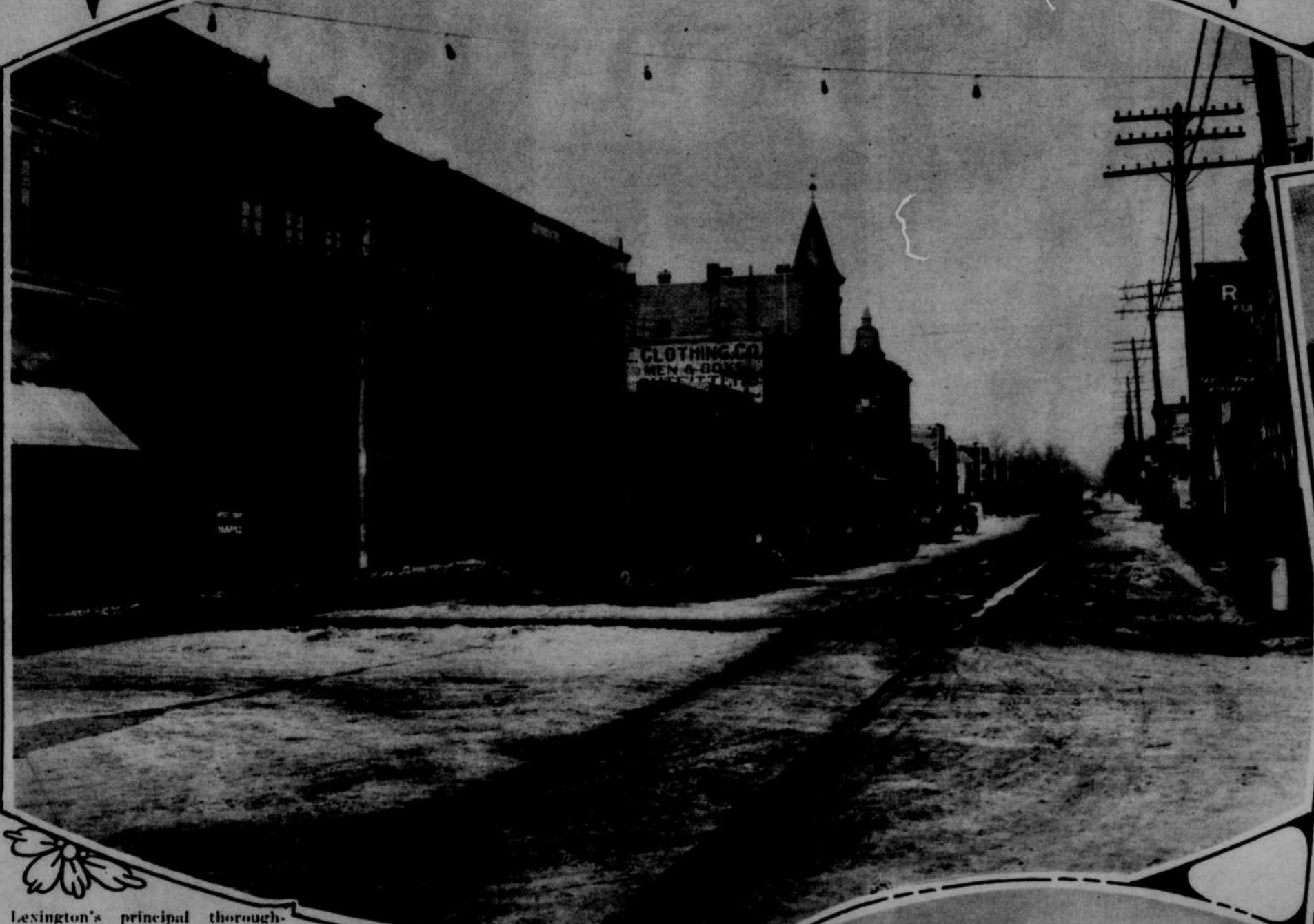
Lexington's principal thoroughfare.