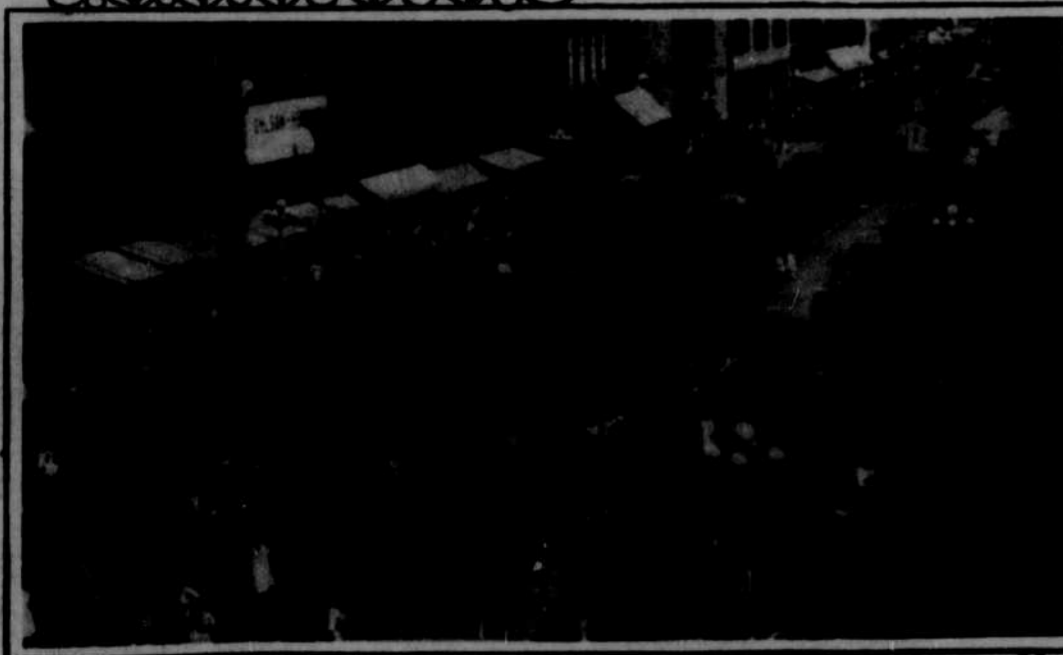
A real busy day along Central Avenue in Kearney.