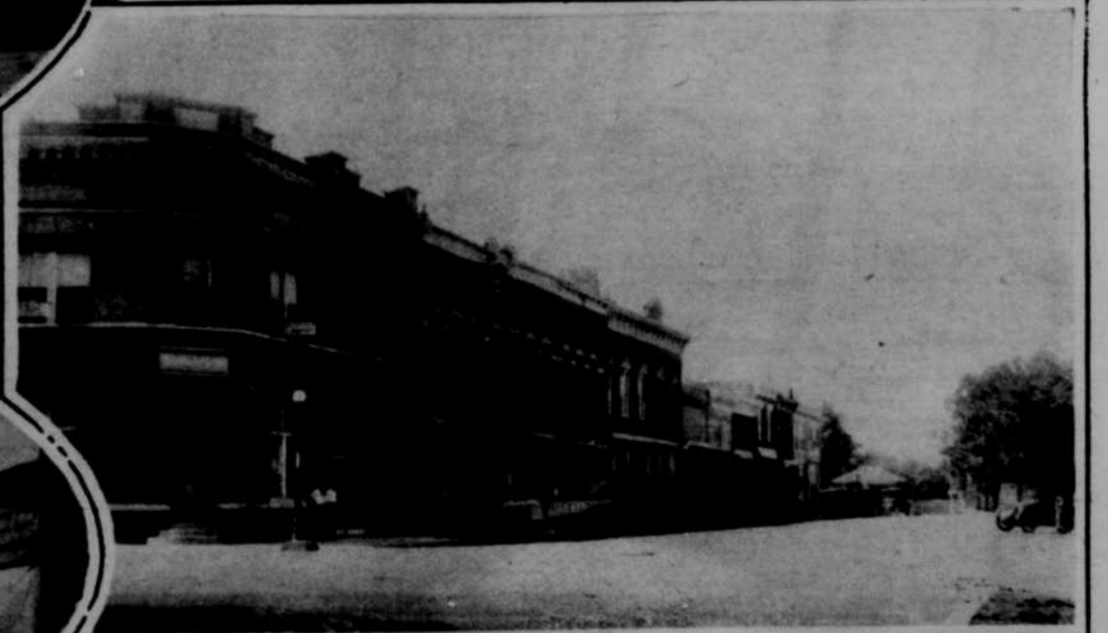
Shelton's wide, paved street.