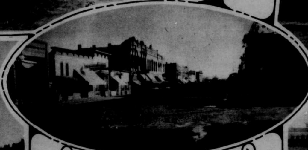
It is Main street in name and in fact in Crete.