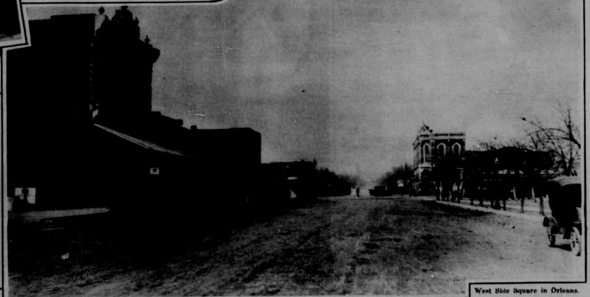
West Side Square in Orleans.