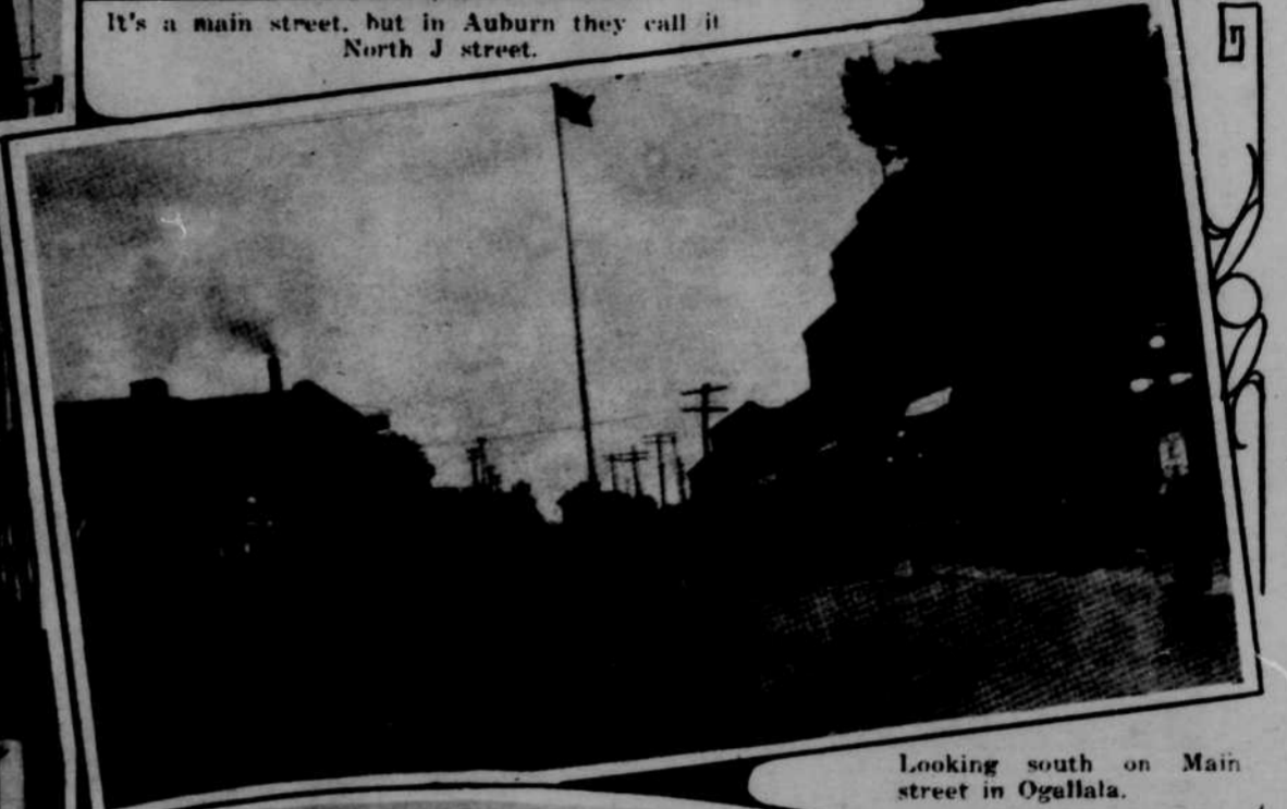
Looking south on Main street in Ogallala.