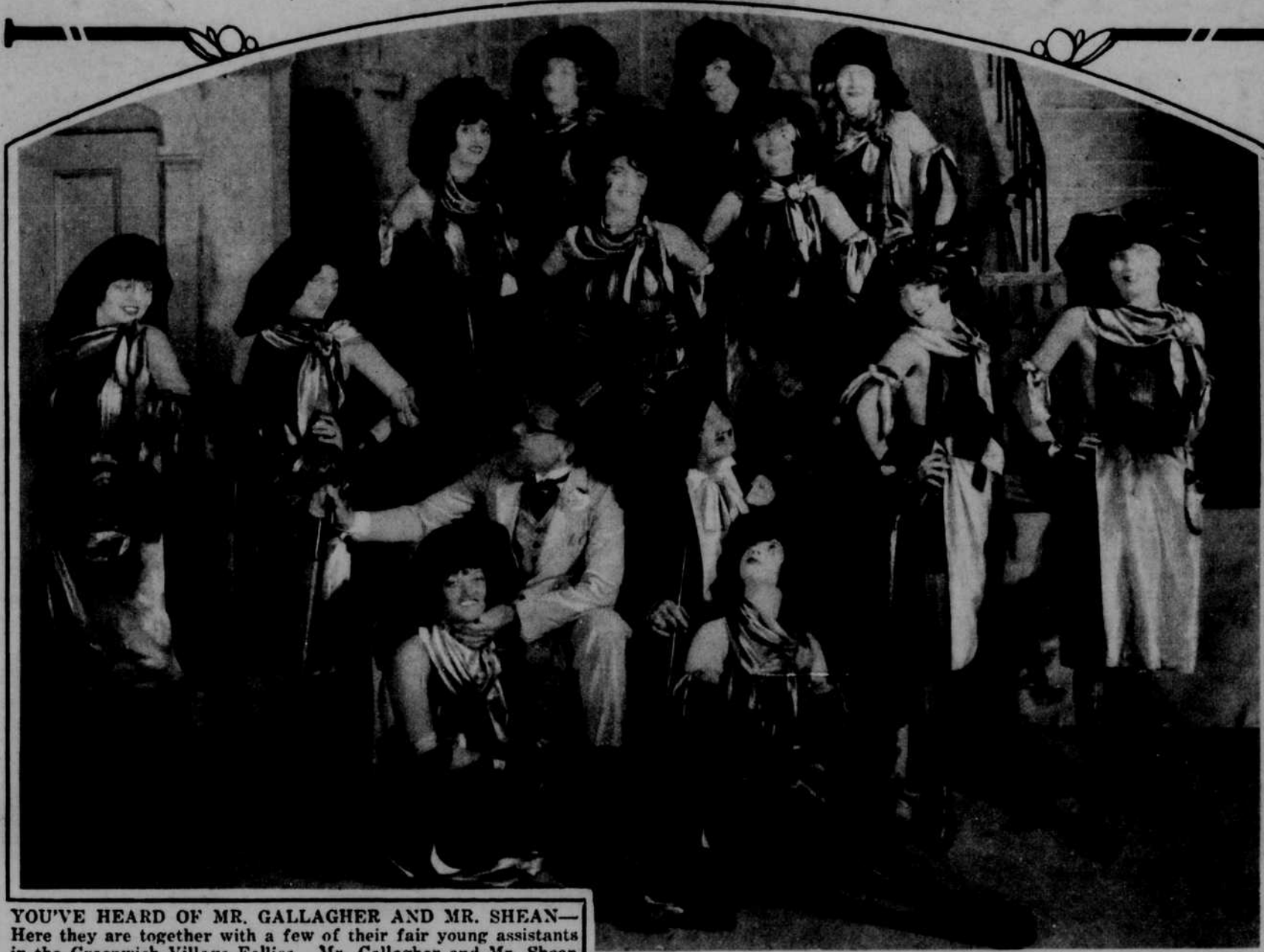
YOU'VE HEARD OF MR. GALLAGHER AND MR. SHEAN— Here they are together with a few of their fair young assistants in the Greenwich Village Follies. Mr. Gallagher and Mr. Shean and the Greenwich Village Follies will be in Omaha for a four-day engagement at the Brandeis theater beginning February 15.