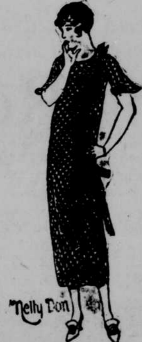
A Quaint Home Frock of Windsor Print

No. 375—A fresh “sunshiny” frock, with effective tailored motif at the neck and trim slipped cleverly through slashes in pockets—little touches which mark it a Nelly Don. Particularly pretty in blue, orchid, rose or soft yellow, and only —1.50