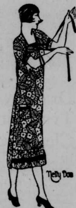
Paris Inspired This Clever, Exclusive Nelly Don

No. 380—The skirt of this novelty brae loch gingham is cleverly piped and trimmed to complement the unique tie arrangement. The tie fastens through two bound button holes. A dainty, youthful plaid in gray and rose, blue and yellow, coral and blue, peach and blue. —2.98