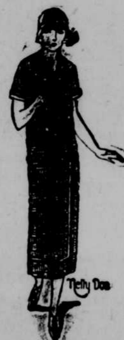
A Dainty, Youthful Bracloth Plaid

No. 346—A French morning frock with tiny sleeves ruffled under the arm. Fashioned on long, slender lines; yet inverted pleats below the belt give needed fullness. Beige piped in red, beige piped in tan, blue piped in peach and blue piped in red. —1.98