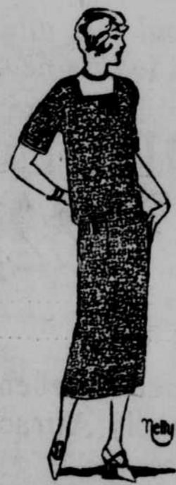
A Neat Percalé Morning Frock

No. 375—A fresh “sunshiny” frock, with effective tailored motif at the neck and trim slipped cleverly through slashes in pockets—little touches which mark it a Nelly Don. Particularly pretty in blue, orchid, rose or soft yellow, and only —1.50