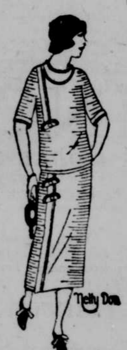
A Rare Combination of Smartness and Economy

No. 356—A smart and sport frock. Through the medium of black bone buttons Nelly Don has simulated an extremely clever vest effect. Silk military braid forms a smart tailored trim. Colors are beige or peach striped in black, blue striped in red, brown striped in green. —3.98