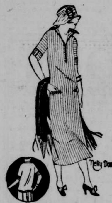
A Smartly Tailored Crepe Suiting

No. 386—Destined to be one of the successes of the season. The narrow tie gives an unexpected dash of smartness; the skirt is flounced prettily in front. Cherry, blue, yellow, green, on a vivid black and white background, trimmed with matching pongette. —2.95