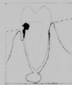
Cross-section of a tooth showing decay at The Danger Line

THROUGHOUT the world today, medical and dental authorities are seeking to safeguard health by warning us of danger. That is why dental authorities have pointed out The Danger Line on our teeth—a vital point where all should practice prevention.