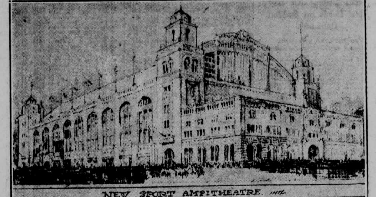
Here is a picture of the architect's drawing of the New Garden, a sports amphitheatre being built in New York City by John Ringling, famous circus man, and Tex Rickard, sports promoter, to replace the historic Madison Square Garden, which will be torn down to make room for a modern office building. The New Garden will be opened about October 15, and will have cost $3,500,000. It will seat 23,000 persons, about 10,000 more than the present garden.