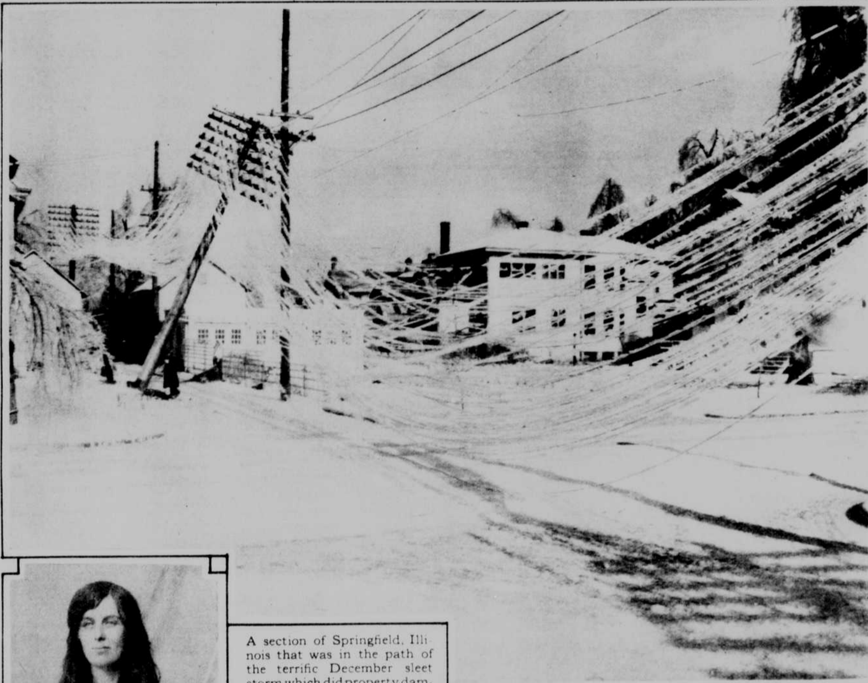
A section of Springfield, Illinois that was in the path of the terrific December sleet storm which did property damage that is estimated at $4,000,000.