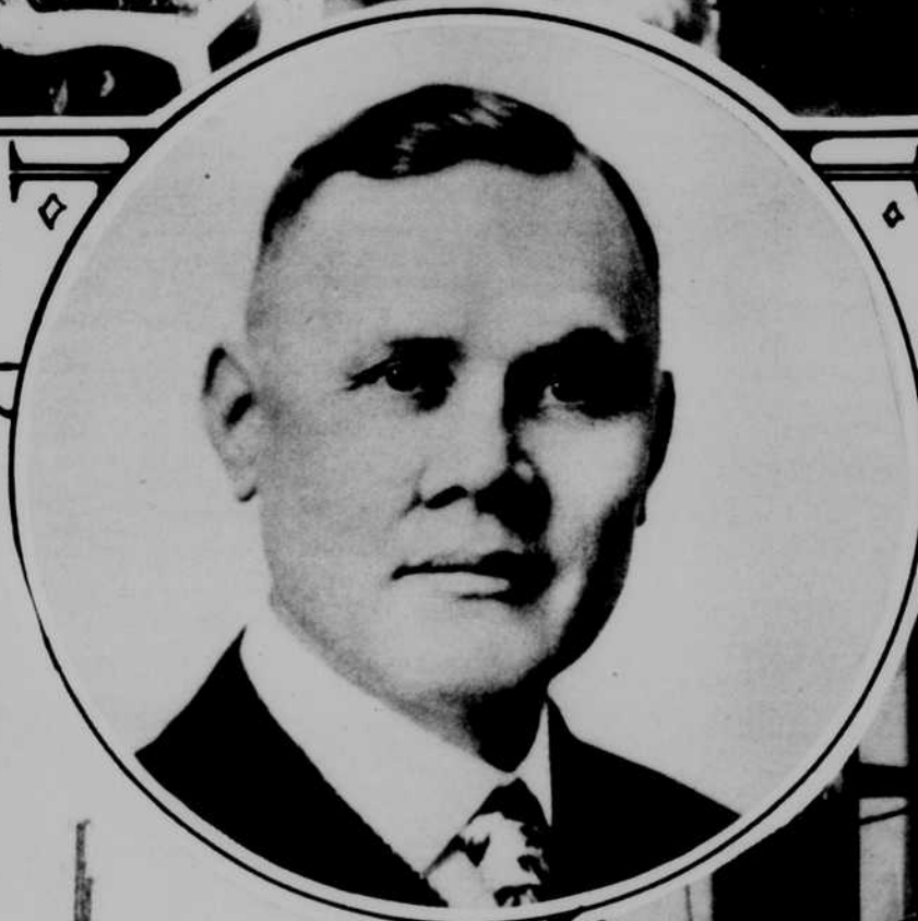
Right—William Green, secretary-treasurer of the United Mine Workers of America, was elected to serve out the term of Samuel Gompers as president of the American Federation of Labor.