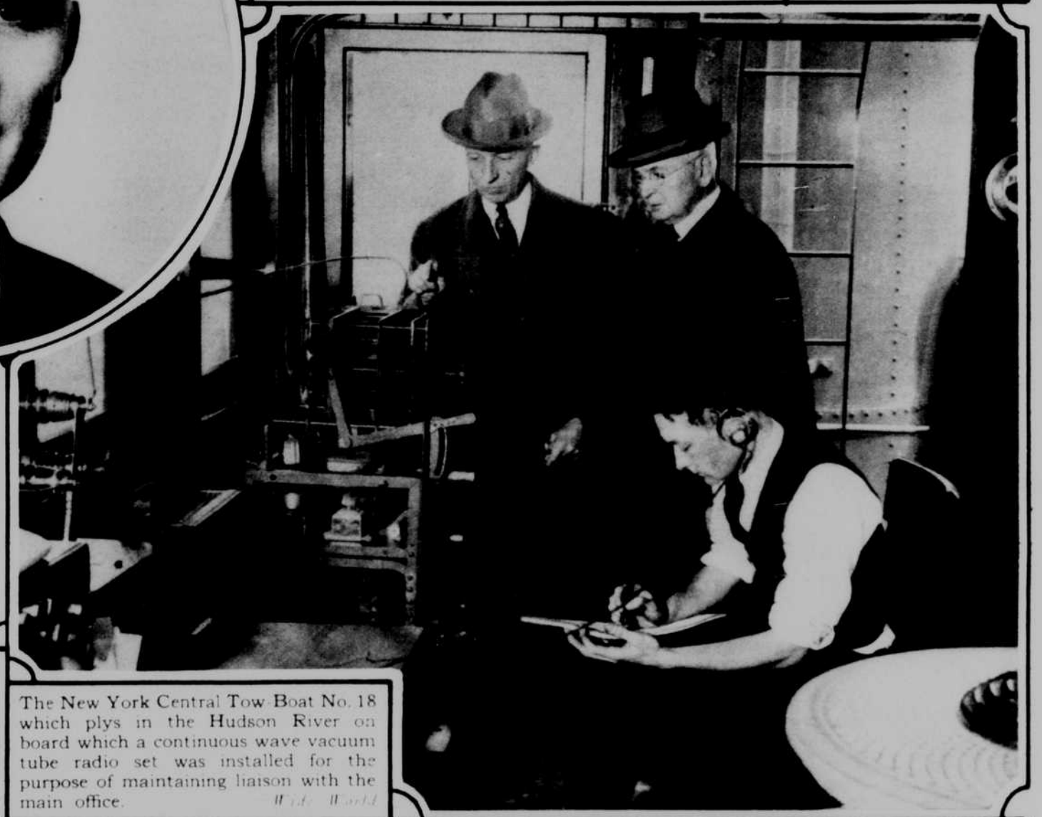
The New York Central Tow Boat No. 18 which plys in the Hudson River on board which a continuous wave vacuum tube radio set was installed for the purpose of maintaining liaison with the main office.