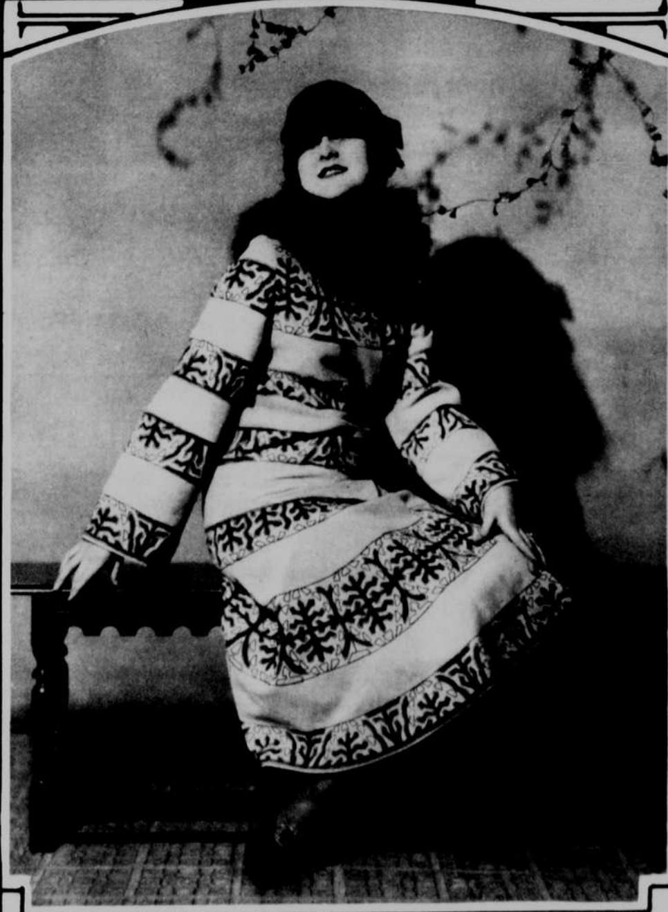
Mocassin, is the name of this attractive Russian Applique suit for spring in colors of periwinkle and black.