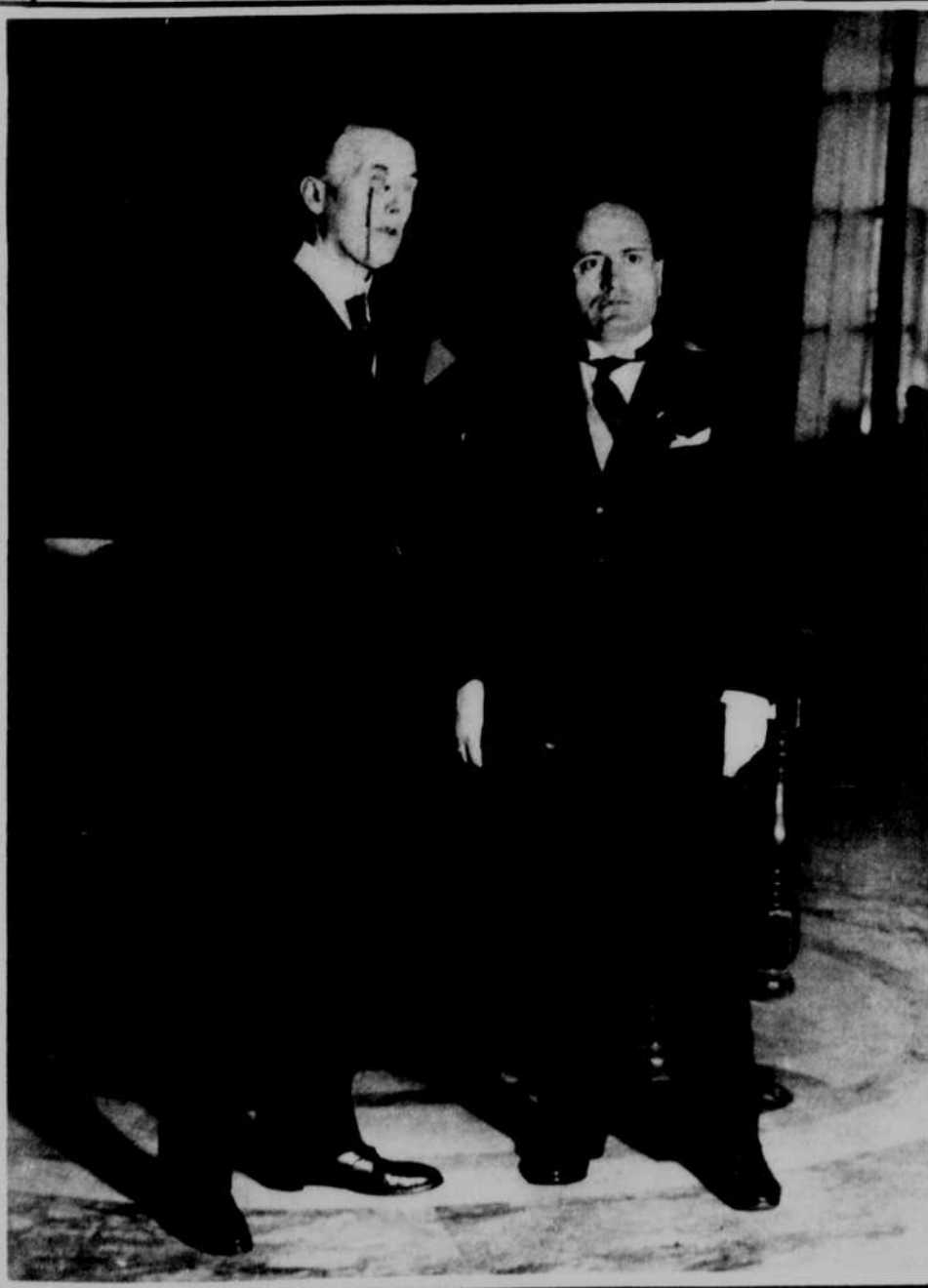
Premier Mussolini receives Austen Chamberlain, British Secretary of State for Foreign Affairs, in Rome, at a conference which revives an Anglo-Italian accord in the Mediterranean.