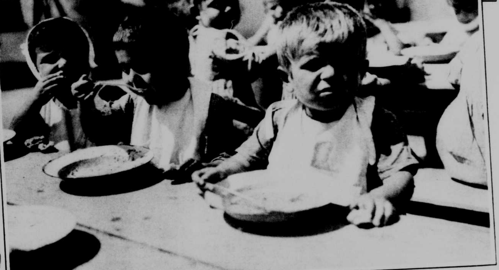
These youngsters look fat and healthy, but they were only recently saved from starvation by the Near East Relief orphanage in Palestine.