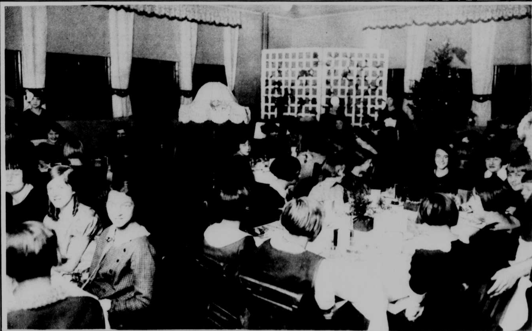
Practical experience is the keynote of the home economics department of the York high school. In the sewing classes the girls are making clothes for two children in the Mother Jewel's home. The other night the cooking class prepared and served a banquet to 60 members of the domestic science department.