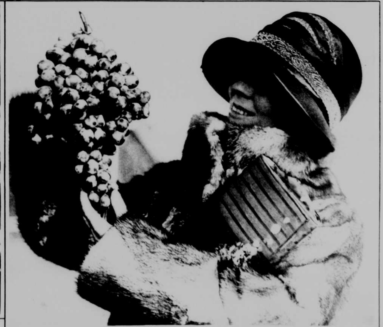
A four-pound bunch of grapes. This is a record bunch of ambr grapes on a single stem. They were grown in Maryland.