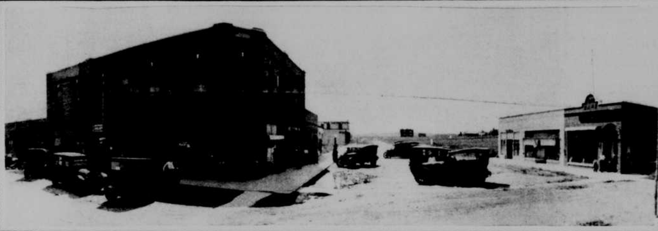
Nebraska main streets. In this case it's almost the whole town. Stapleton, Neb. wasn't established until 1912, but now it has a population of 500 and is growing. How about your own home town? If you'll send a photograph of the main street of your town to the Alcovrature Editor, The Omaha Bee, it will be printed in this section.