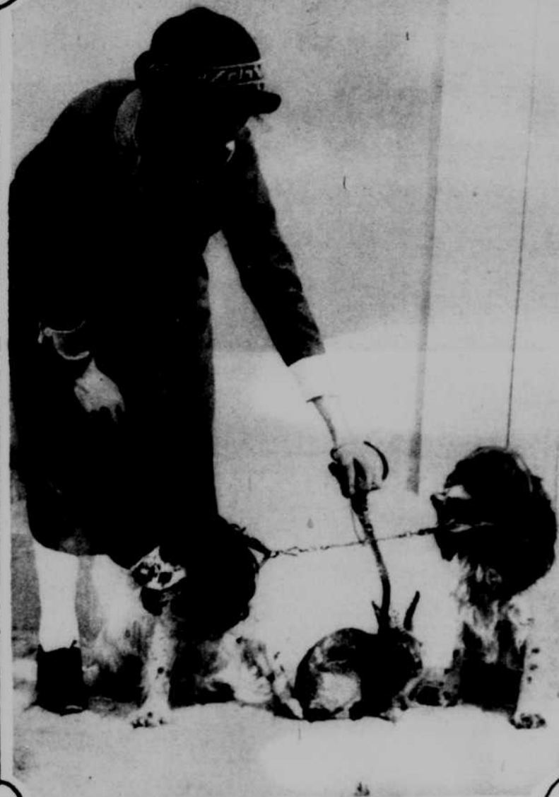
LEFT—Paris introduces vogue in pets for promenade. This fair Parisienne set a vogue in the French capital recently when she brought along a pet rabbit, muzzled with her pair of prize cocker-spaniels.