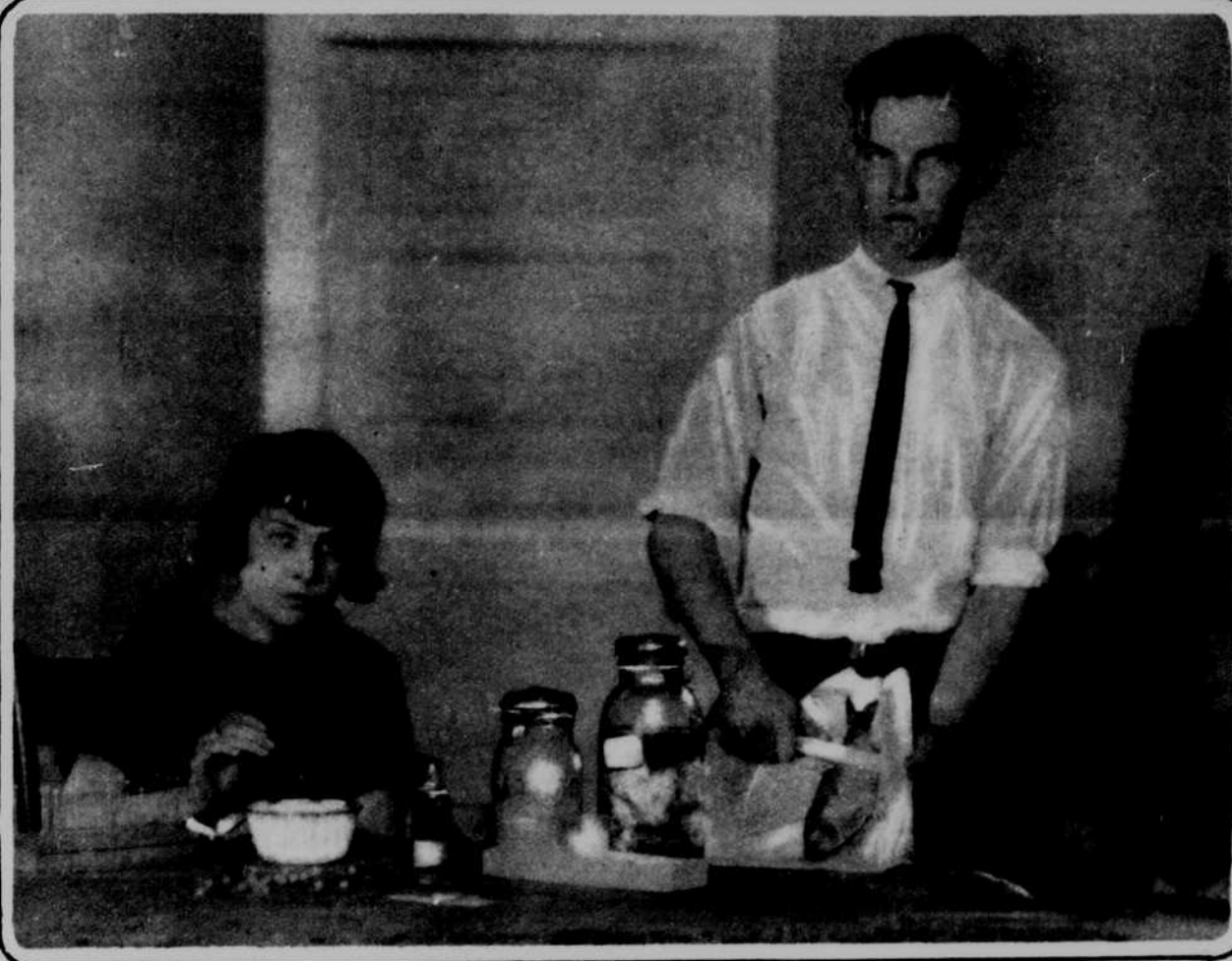
Artificial pearls made on Cape Cod. The scales of herring are placed in a bottle and secret solutions of chemicals poured over them. These chemicals dissolve the scale and make them into a solution. The solution is then placed into a pan and each pearl is dipped into the solution and set into a rack to dry. The base of the pearl is made of smoked glass preparation and is indestructible. The pearls that are dipped and handled by hand sell on the market for about $200 a string and are so close to the genuine pearl that only an expert can distinguish the difference.