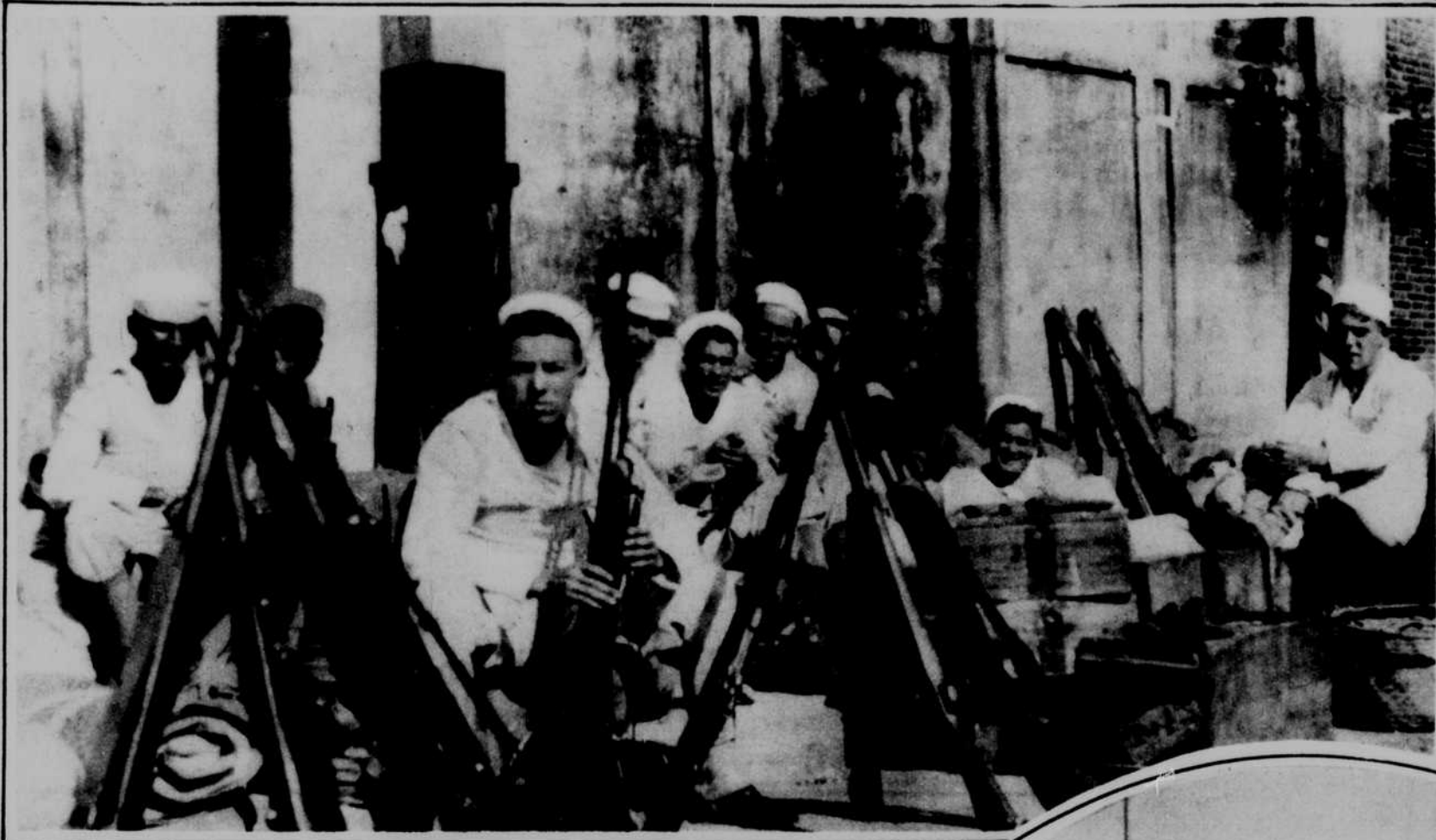
LEFT — Uncle Sam's sailors maintain order in Shanghai during recent battles. Various Powers each landed sailors and marines, the United States taking a leading part in maintaining order.