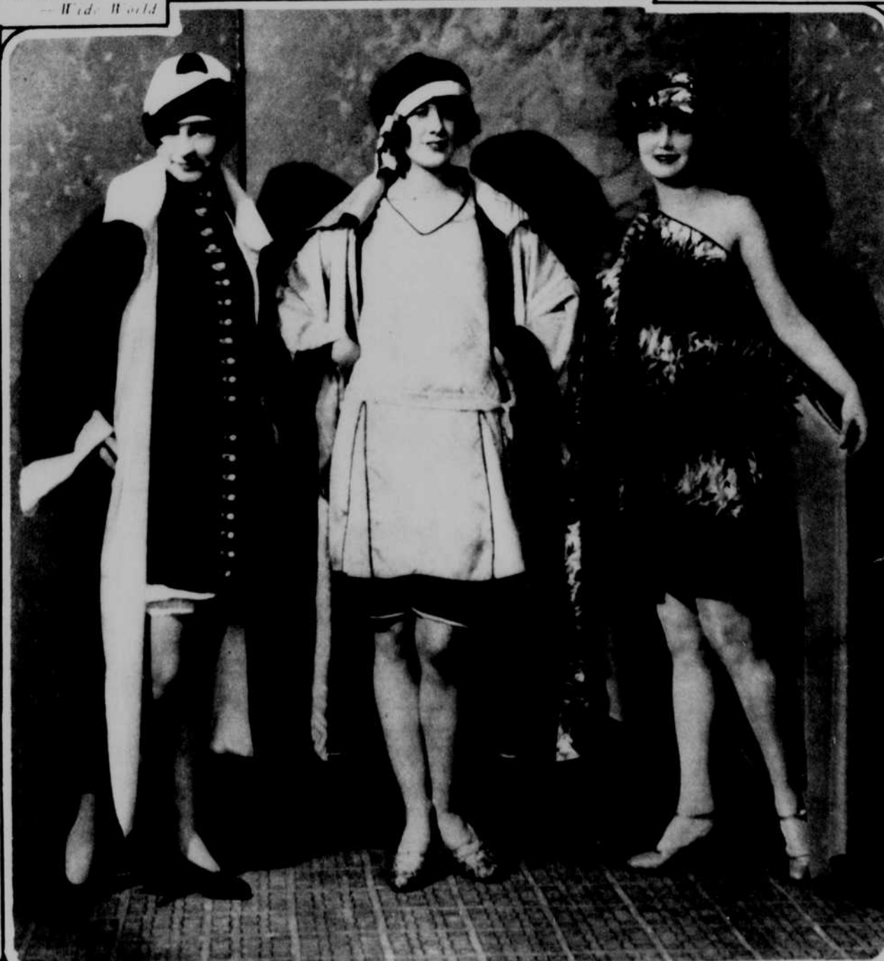
These Herbert Kohn bathing suits of black and white cord silk, of satin brocade with black satin, and of printed tiger silk, were among the smart modes for spring shown at the Spring and Summer Revue of the Style Creators of America.