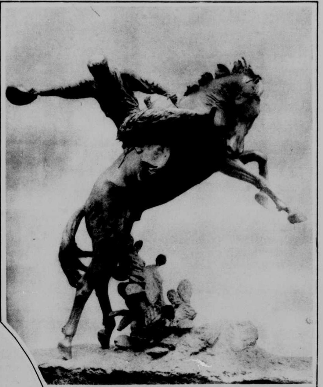
RIGHT "Cowboy," equestrian statue of inimitable fire and spirit, will be mounted on the State Capitol grounds in Austin, Texas.