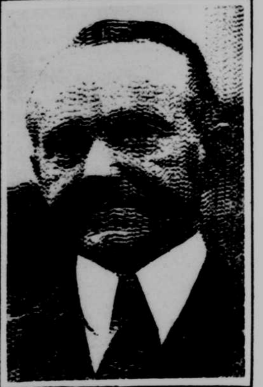
Photoradiogram portrait of President Coolidge, which was sent from London to New York.