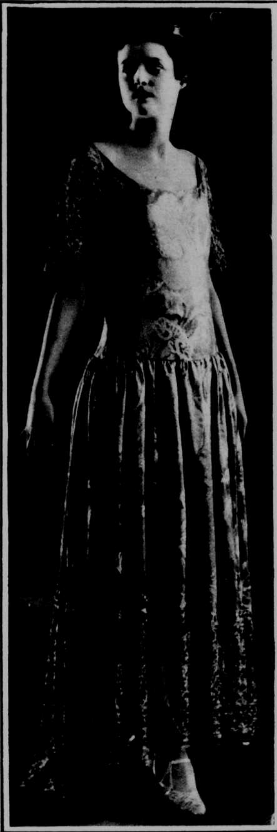
A bouffant dress of rich brocade. One of the most gorgeous materials used for this season. The brocade combines gold, jade green and red, and the lace is of gold.