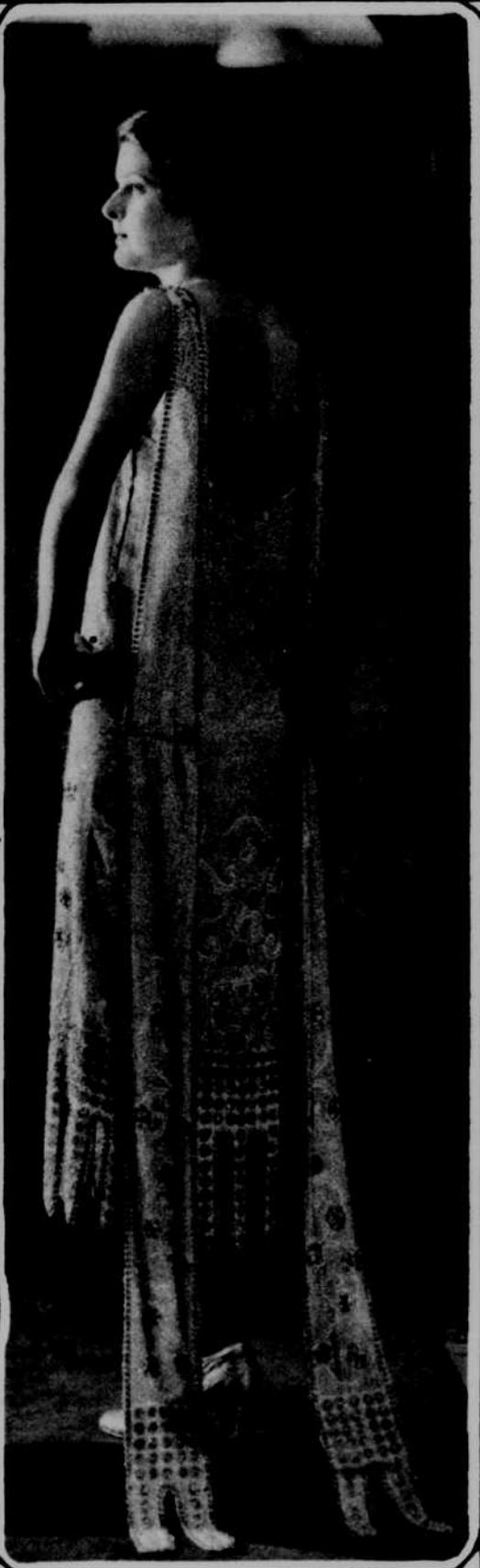
An effective example of the prevalent straight lines in evening gowns is shown in this new creation in white satin embroidered with gold and silver beads.