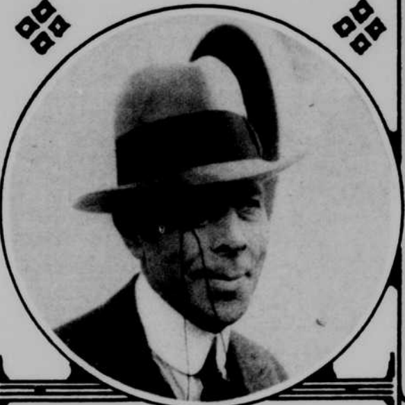
George Arliss, stage and screen star, back in this country after an extensive tour abroad.