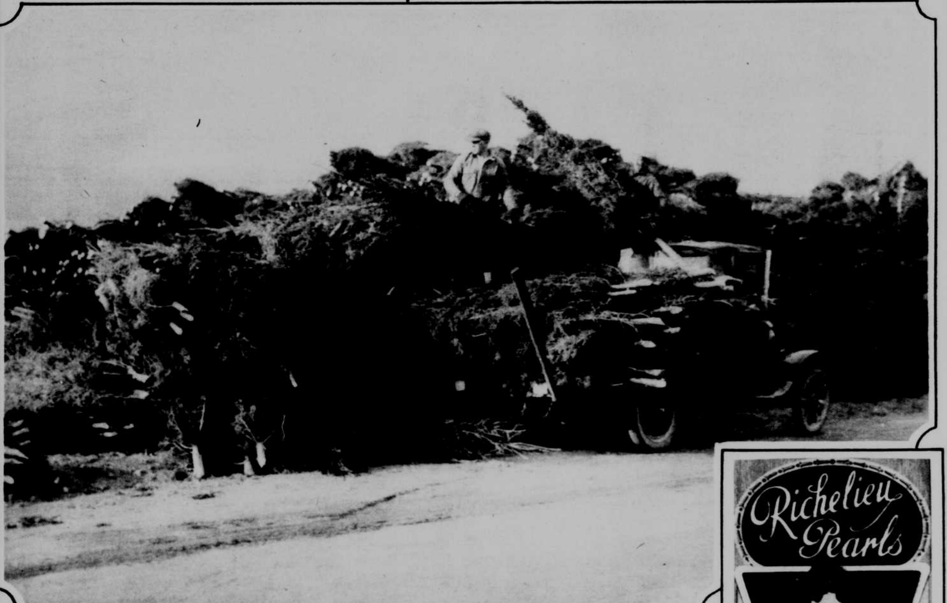
Christmas trees cut in and near Woodstock, Vermont, ready for the market, after undergoing a rigid examination by Federal Inspectors, who look for traces of the dangerous Gypsie Moth.