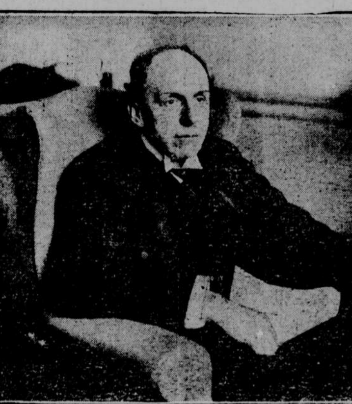
New York-Viscount Cecil of Chelwood, formerly Lord Robert Cecil, has been declared winner of the first $25,000 award of the Woodrow Wilson foundation.

Norman H. Davis, president of the foundation board of trustees, announced Viscount Cecil has been unanimously chosen by the jury of award as the person "who has rendered the most meritorious service of a public character looking toward the establishment of peace through justice, and who had done most to give effect to the ideals and the great plan for world peace to which Mr. Wilson gave so much thought and effort."