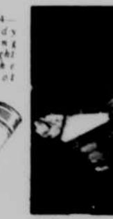
No. 2674—Eveready Focusing Spotlight with 300 foot range.