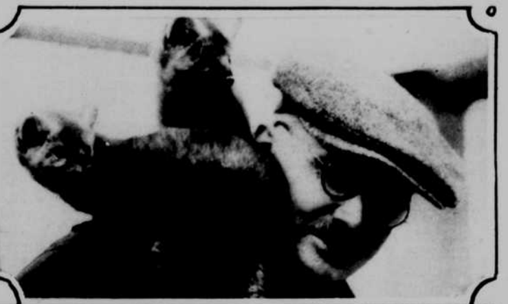
RIGHT—Young sables bred and raised by the Alaska Silver Fox Farms, Ausable Chasm and Lake Placid, New York. These sables are six months old and weigh one pound each. They are the only sables ever raised in captivity and are worth $1000 a piece.