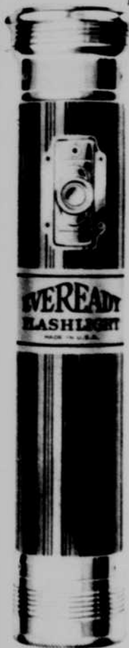
No. 2672—Eveready Focusing Spotlight with 500 foot range.

Manufactured and patented by NATIONAL CARBON COMPANY, INC. New York San Francisco Canadian National Carbon Co., Ltd. Toronto, Ontario