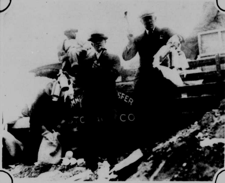
The hammers of prohibition enforcement officers come down on a few of the 24,000 quarts that were taken from a freight car where they were hidden amongst a shipment of lumber under which label they were being shipped. The seizure is said to be one of the largest ever made in the south.