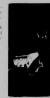
No. 2671—Eveready Focusing Spotlight with 500 foot range.