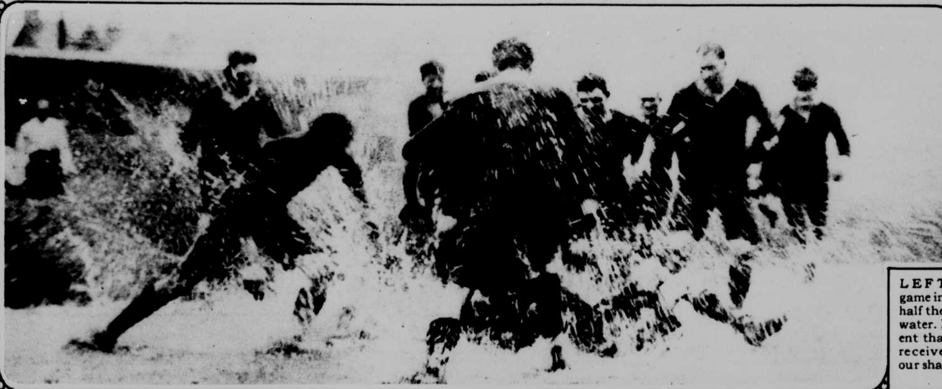
LEFT—Football game in progress, with half the ground under water. It being apparent that England has received there's and our share of rain.