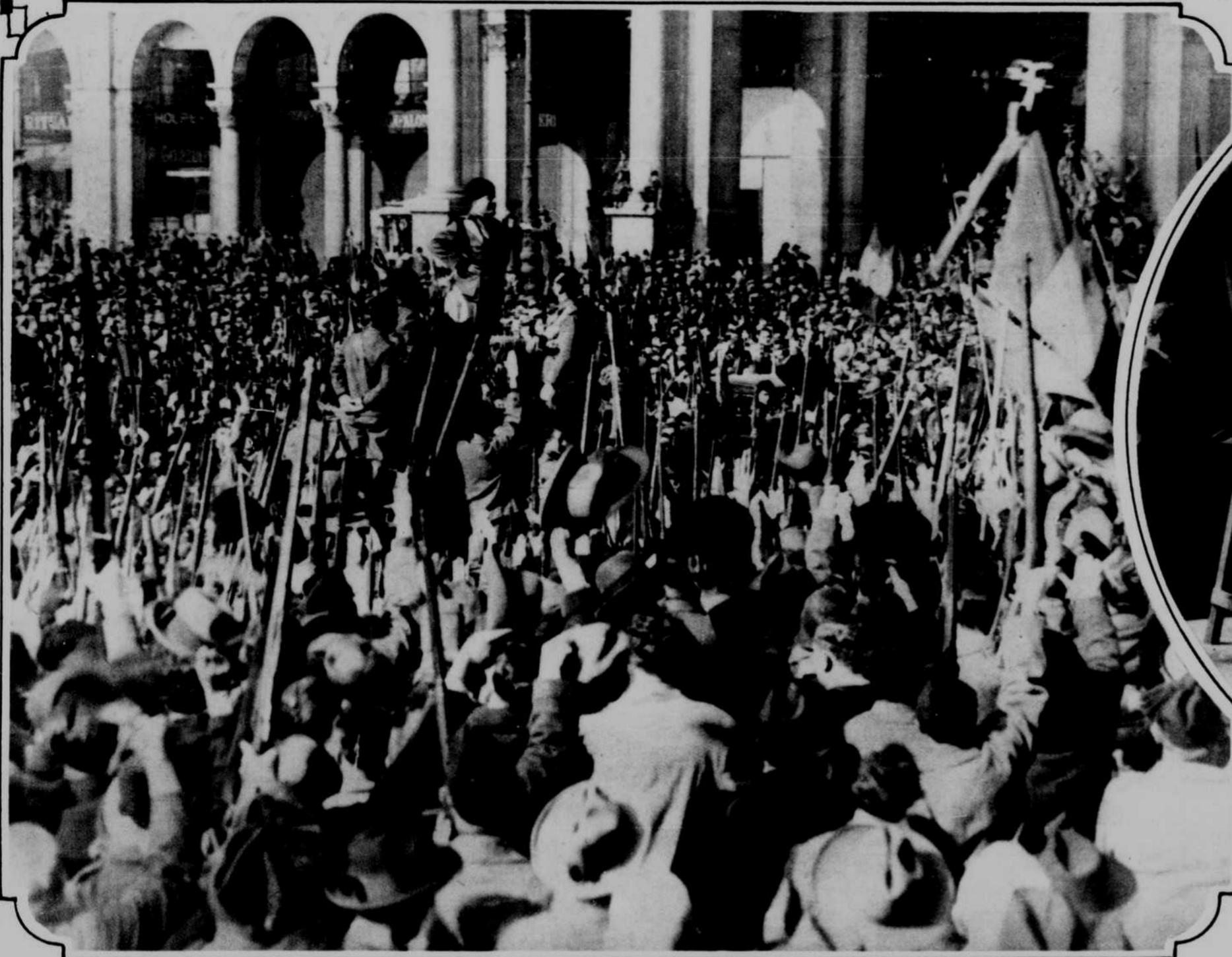
Premier Mussolini addressing the militia in the Piazza del Duomo in Milan, following which the leader of the Fascismo, called for the oath of allegiance. The militia are shown taking the oath with right arm extended.