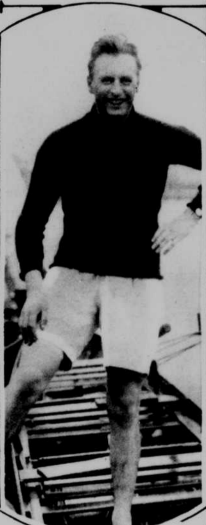
A royal rower. Prince Olaf of Norway, now an undergraduate at Balliol College, Oxford, who rows three in his college four.