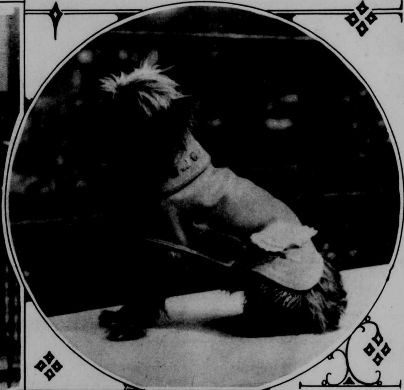
A dog's day: Paris fashions for canine aristocrats. Lunch at the Ritz. Smart little coat in new beige broadcloth with hand-embroidered collar and pocket and real lace handkerchief.