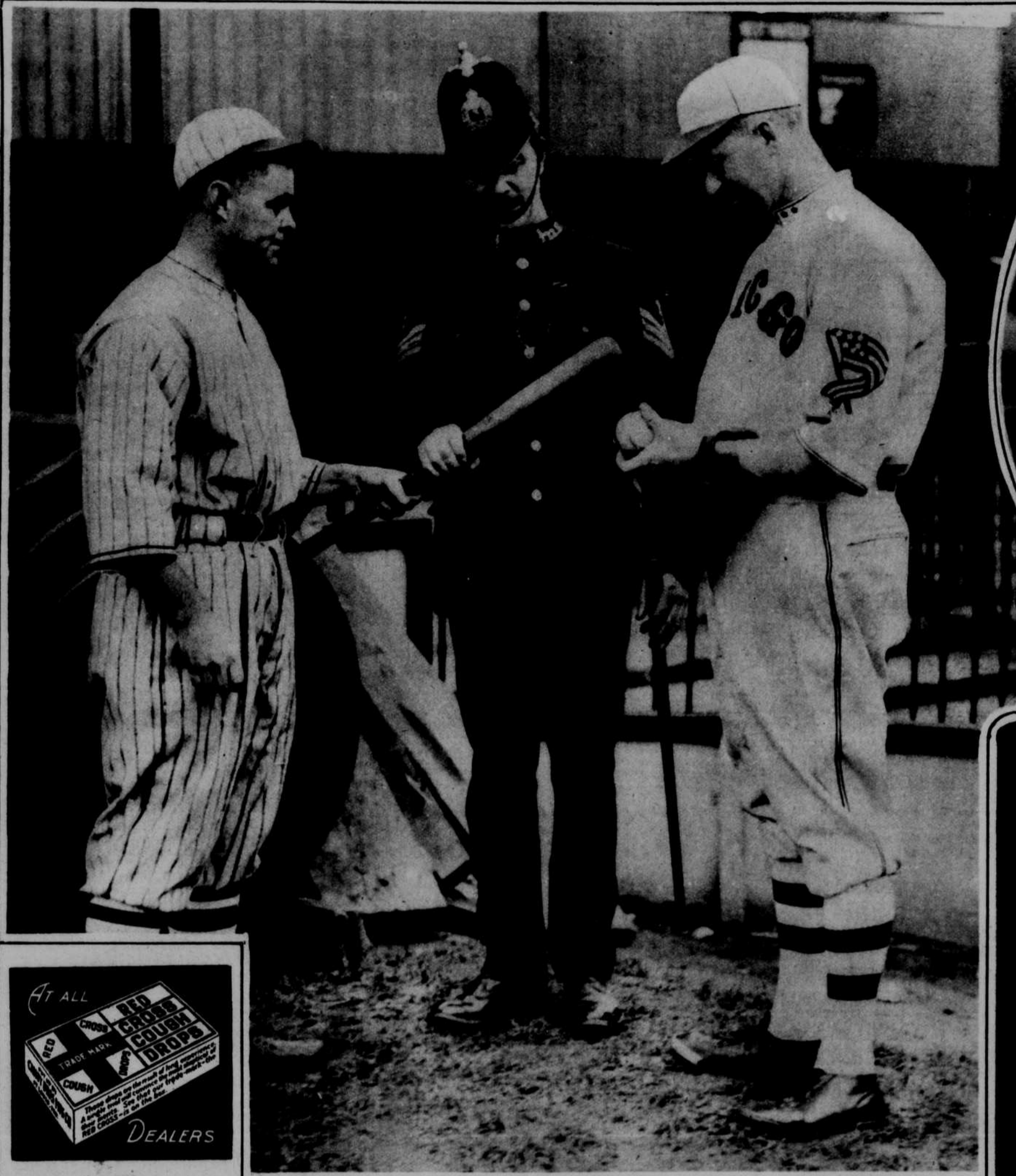
English "Bobby" at Liverpool, looking over the baseball bat of Willie Kamm of the Chicago "White Sox," who incidentally is wearing a Giant uniform while "Red" Faber, Chicago pitcher looks on.