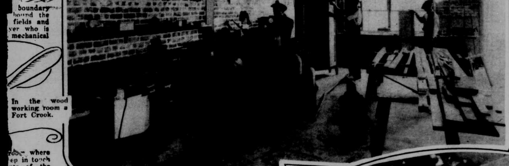
In the wood working room at Fort Crook.