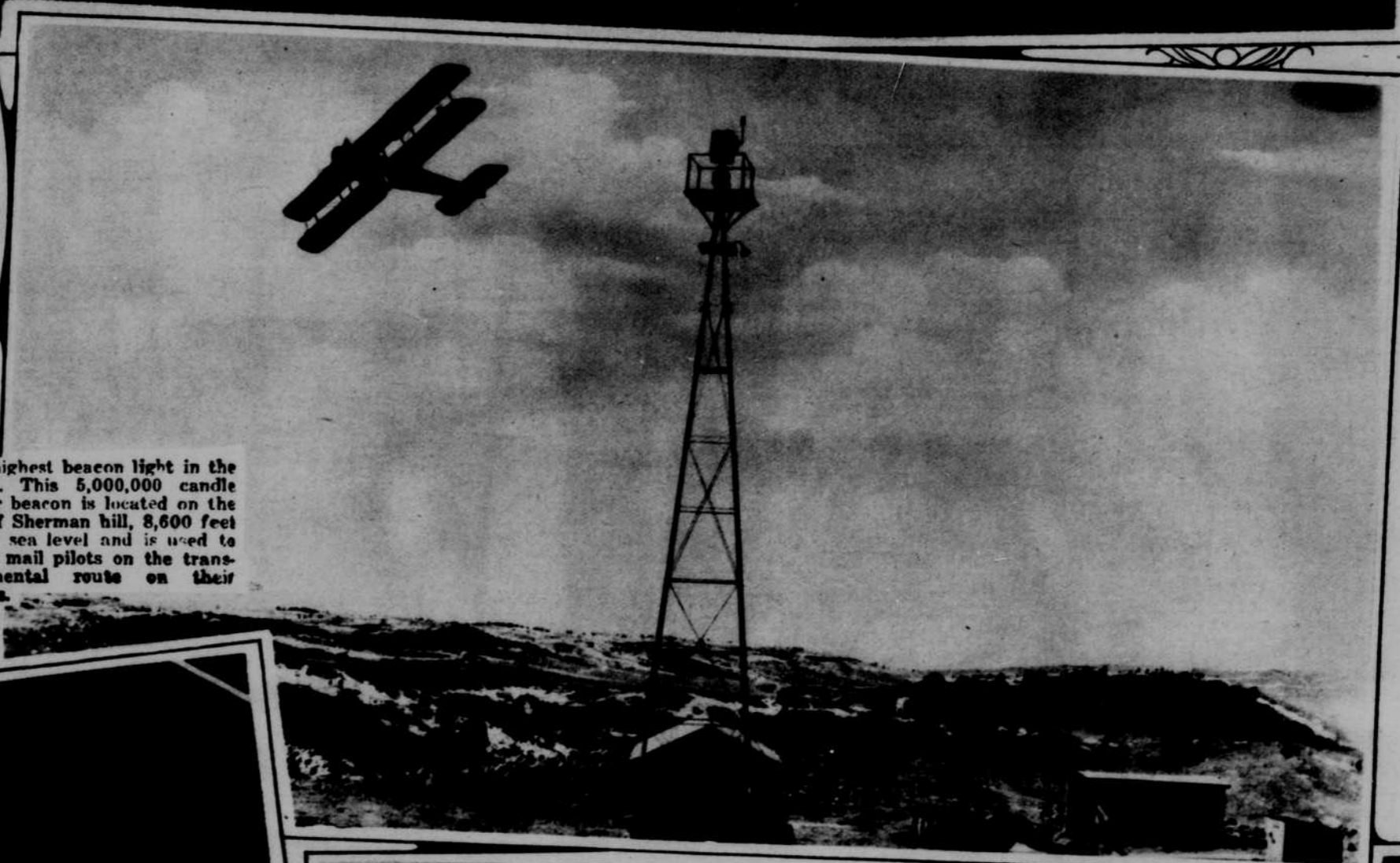
The highest beacon light in the world. This 5,000,000 candle power beacon is located on the top of Sherman hill, 8,600 feet above sea level and is used to guide mail pilots on the transcontinental route on their flights.