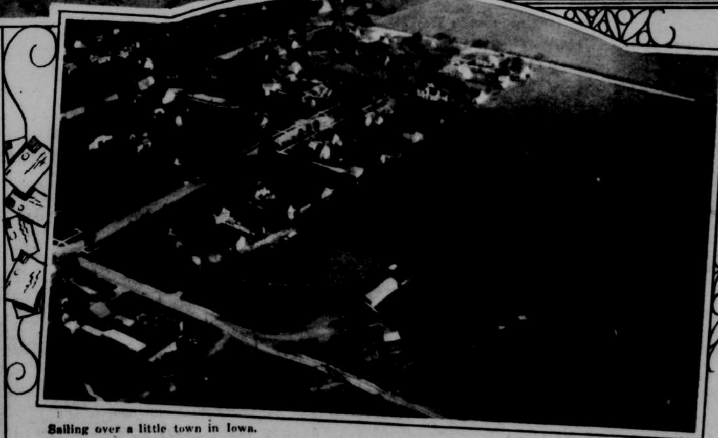
Sailing over a little town in Iowa.