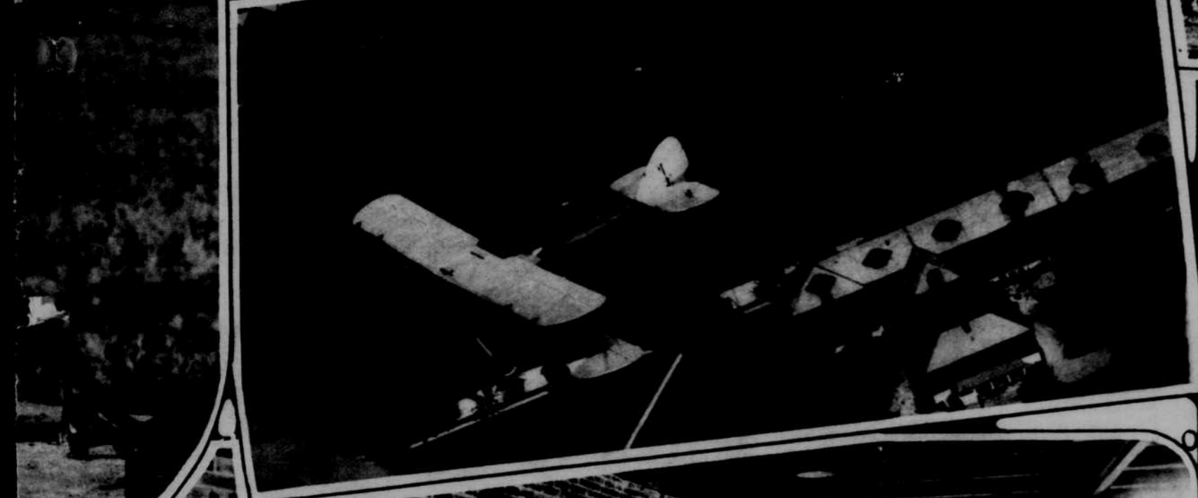
Looking down on the parade ground at Fort Crook.