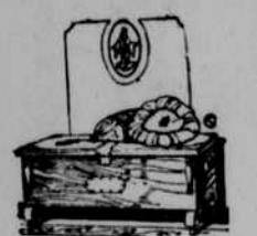
Cedar Chest, $14.50

1 down buys this full length vanity dresser, finished in rich walnut veneer, plate mirror, Queen Anne design.