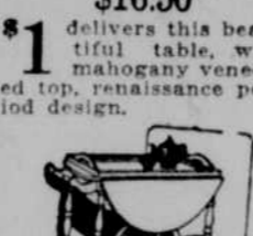
Davenport Table, $16.50

1 delivers this day bed complete with mattress. It converts into a full sized bed at night.