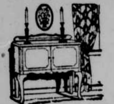
Radio Cabinet, $17.95

1 delivers this beautiful 40-inch chest nicely trimmed.