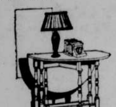
Gateleg Table, $14.75

1 delivers this large size walnut veneered radio cabinet. Special compartments for batteries and accessories.