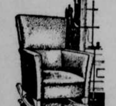
Leather Rocker, $16.50

1 delivers this easy chair, covered in velvet. Sturdily constructed and beautiful.