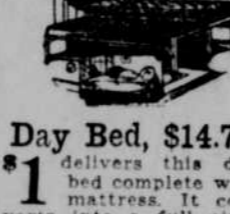
Day Bed, $14.75

1 delivers this guaranteed table, with porcelain top. There's none better made.