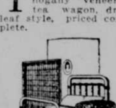
Tea Wagon, $22.50

1 delivers this beautiful table, with mahogany veneered top, renaissance period design.