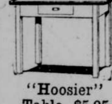
"Hoosier" Table, $5.95

1 delivers this large size walnut veneered dresser with French plate mirror.