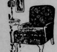
Coxwell Chair, $29.50

1 down buys this beautiful Queen Anne walnut veneered buffet. Excellent value.