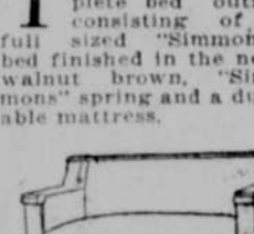
Bed Outfit, $19.75

1 delivers this mahogany veneered tea wagon, drop leaf style, priced complete.