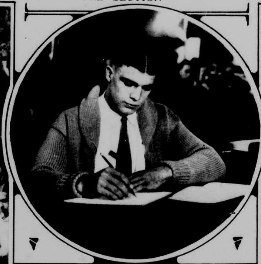
Georgia's Aspiring Heavyweight Settles Down to "Three R's." W. L. (Young) Stribling photographed in the classroom at University School for Boys, Atlanta, Ga., where he is taking an academic course after which he will enter college. It is said the Georgia boxer has an average of 95 percent in all his studies.