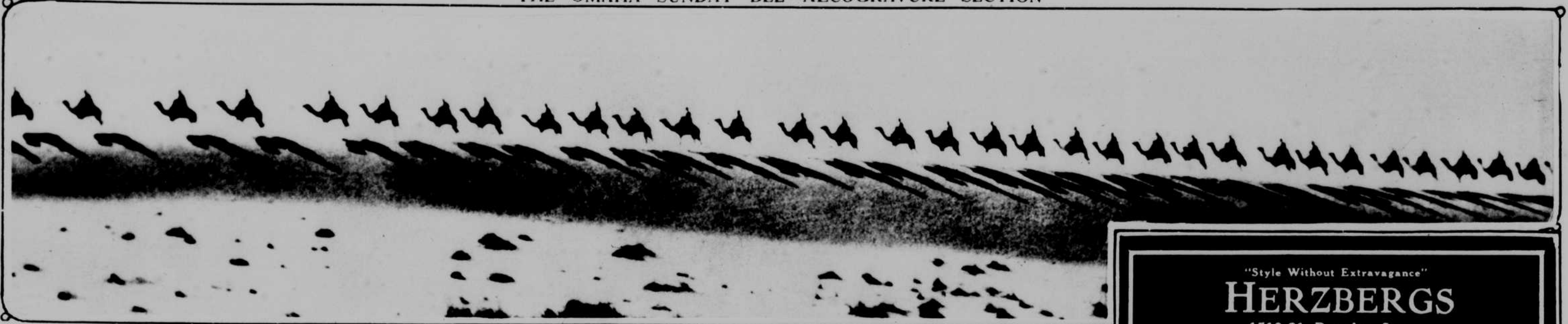
The Police of the vast Egyptian Desert. The Egyptian Camel Corps which polices the whole of the great Egyptian desert, officered by British.