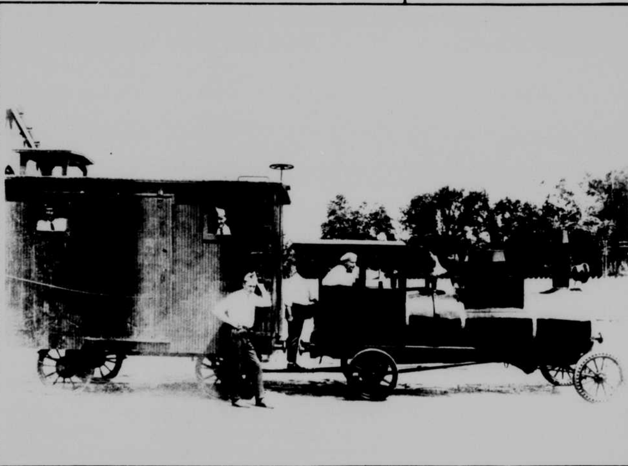
Illinois Legionnaires perpetuate the "Doughboys" mode of travel. They call themselves the "Forty and Eight." They had this odd looking caravan built to attend state and national encampments. The "locomotive" was designed from an automobile.