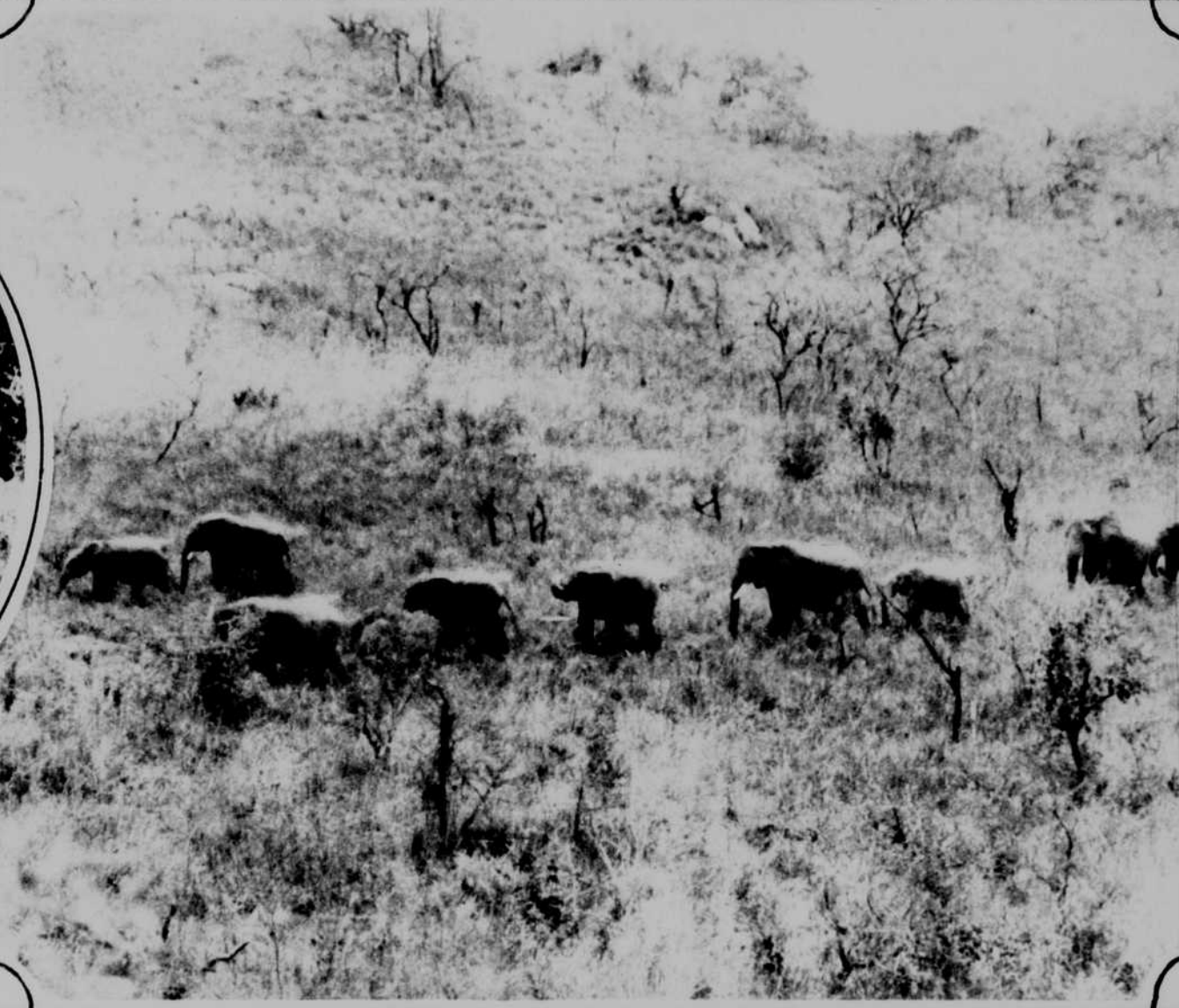
A sight to make primitive man feel at home in the modern world. Elephants going single file across the slopes of Ruwenzori, the Mountain of the Moon, in East Africa, where Mr. Klein spent fourteen years.