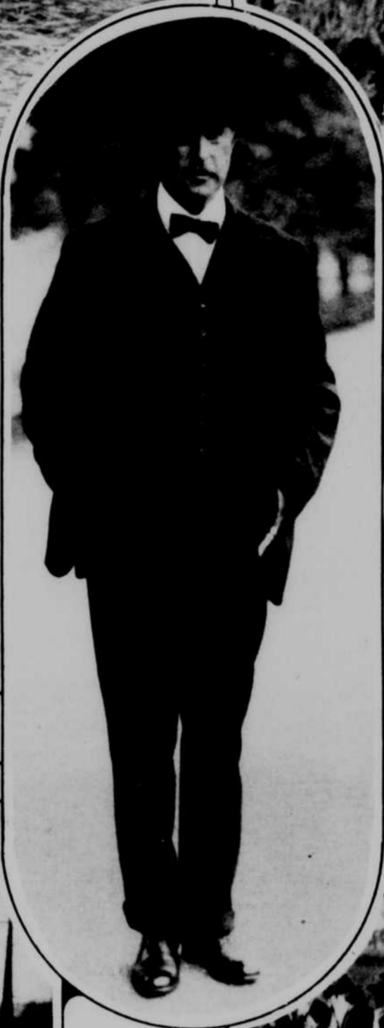
EVEN A KING LIKES TO TAKE A DAY OFF. Here is King Albert of Belgium visiting in London incognito. He is shown taking a stroll in Hyde park.