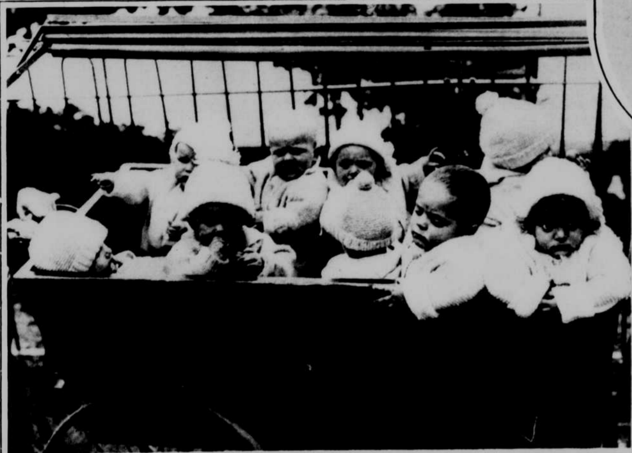
A CARRIAGEFUL OF MISCHIEF —And bubbling youth too. Conditions in this baby carriage are crowded, but everybody seems happy.