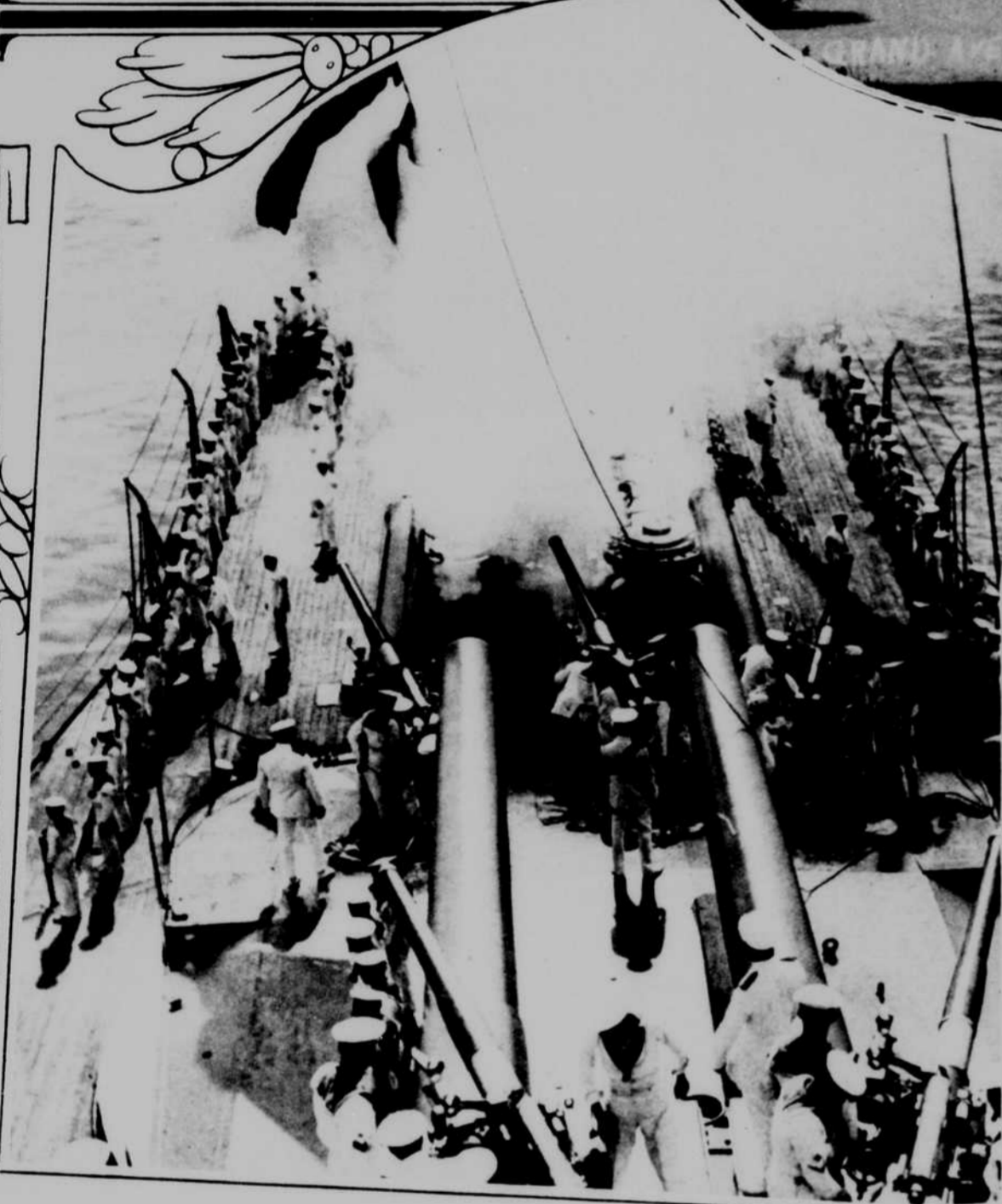
SPEAKING TO HIS ROYAL HIGHNESS, THE KING OF ITALY —The big guns of the Italian battleship Duilio spoke a royal salute to the king just as this photo was snapped.