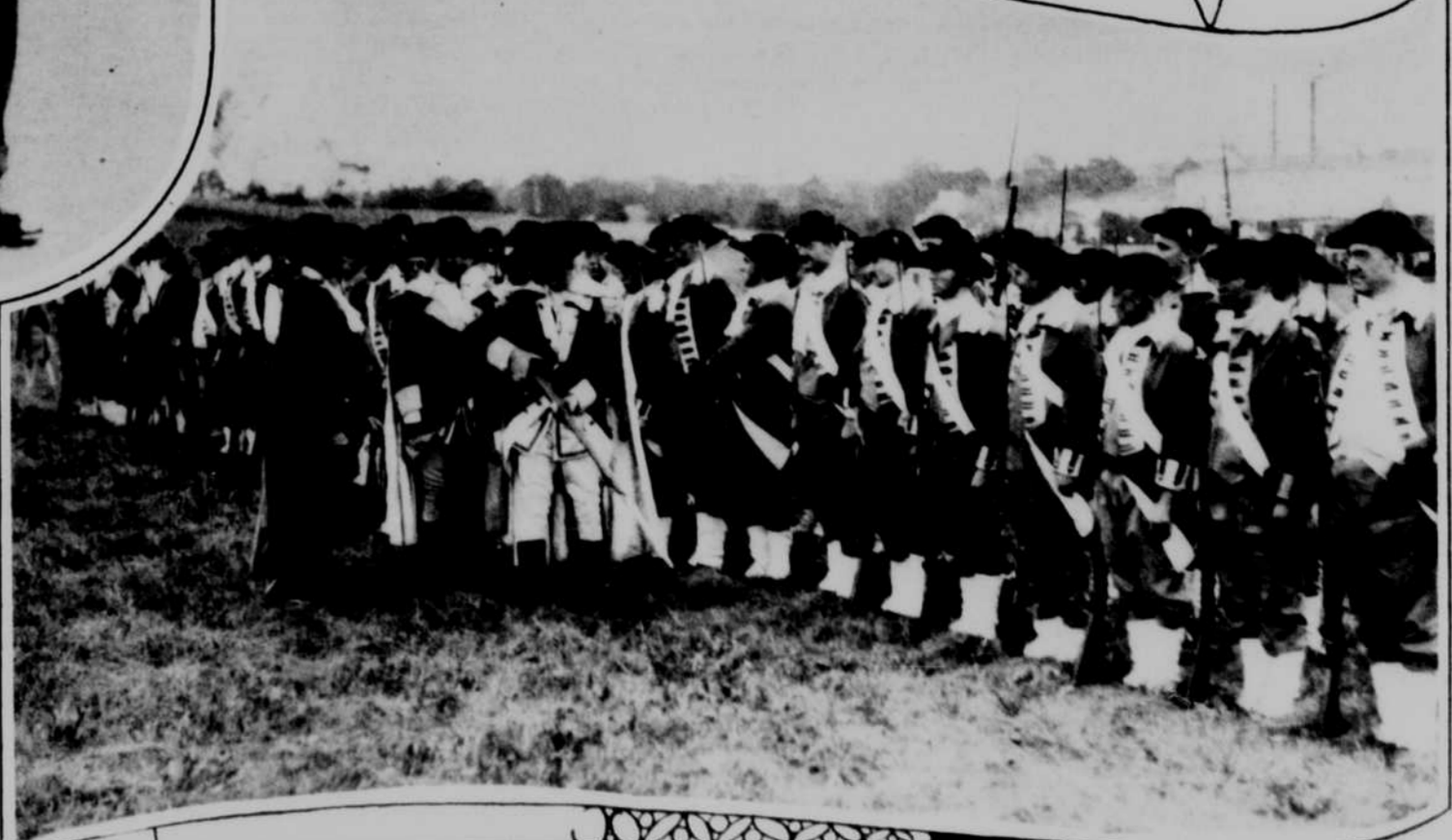
WASHINGTON AT VALLEY FORGE AGAIN. The scene of this historic winter camp was again populated by soldiers of '76 as part of Philadelphia's celebration of the 150th anniversary of the meeting of the first continental congress.