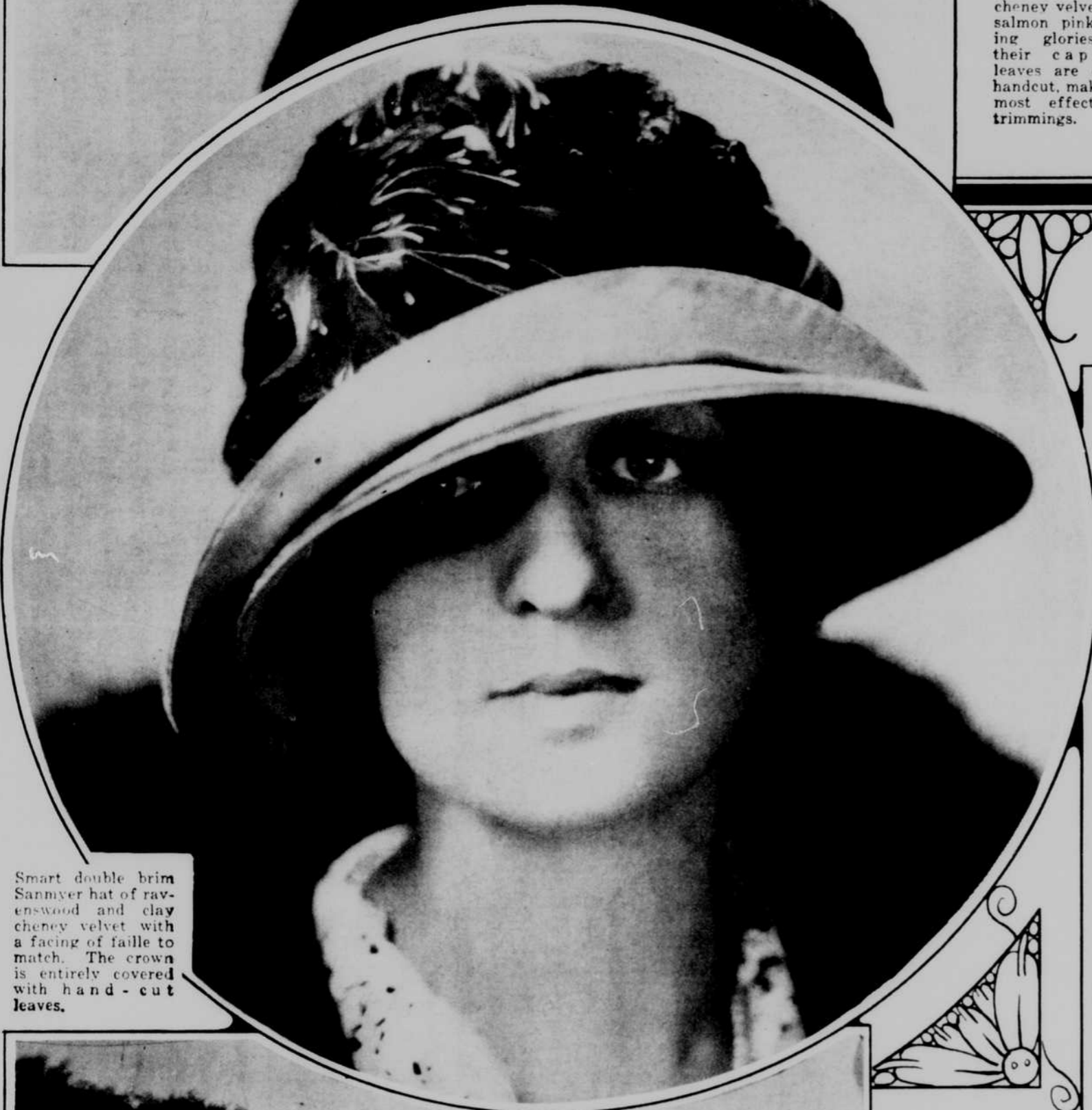
Smart double brim Sammyer hat of ravenwood and clay cheney velvet with a facing of faille to match. The crown is entirely covered with hand-cut leaves.