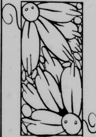
Morning glories inspired the designing of this Sammyer turban of redwood cheney velvet. The salmon pink morning glories with their capucine leaves are entirely handcut, making the most effective of trimmings.