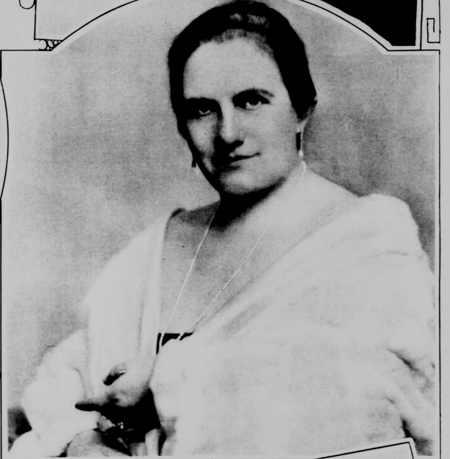
Elena Gerhardt, mezzo soprano, will appear at the Brandeis theater November 12 under the auspices of the Tuesday Musical club.