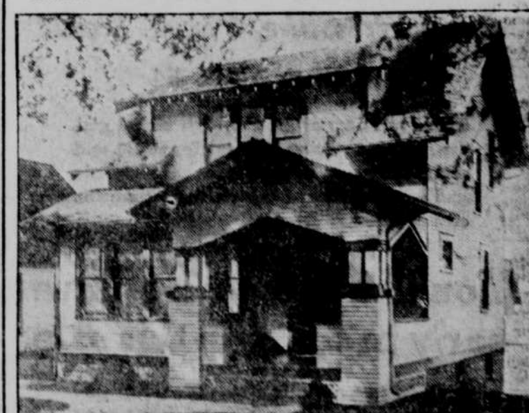
3072 HANSCOM PARK BOULEVARD. Five-room, two-story. Extra large living room with fireplace. Two large bedrooms and bath upstairs. Price $7,500, with garage.