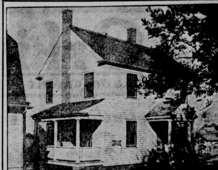
3050 HANSCOM PARK BOULEVARD. On corner lot. Colonial style with garage to match the house. Shingle exterior. Two porches. Outside fireplace, extra large living room, three bedrooms upstairs with bath, tiled floor and built-in tub. Extraordinary good buy at $8,500.