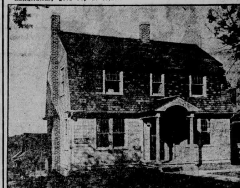
3056 HANSCOM PARK BOULEVARD. Dutch Colonial. Large living room, dining room, kitchen with breakfast nook on first floor. Three bedrooms and bath upstairs. A very compact, well arranged house. Fireplace. Price $8,250, with garage.