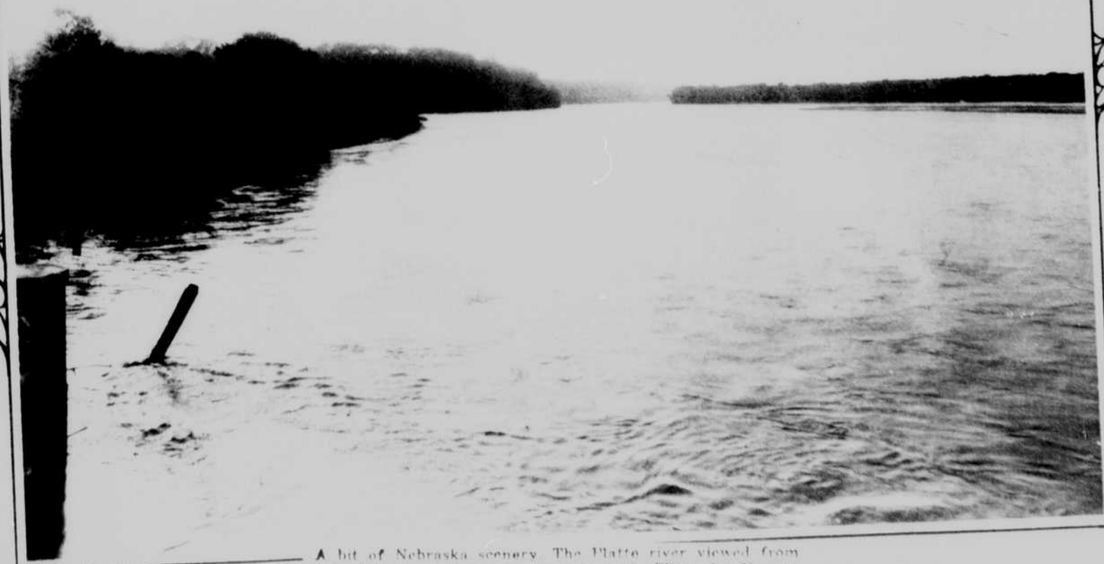
A bit of Nebraska scenery. The Platte river viewed from the bridge at Fremont, looking west.