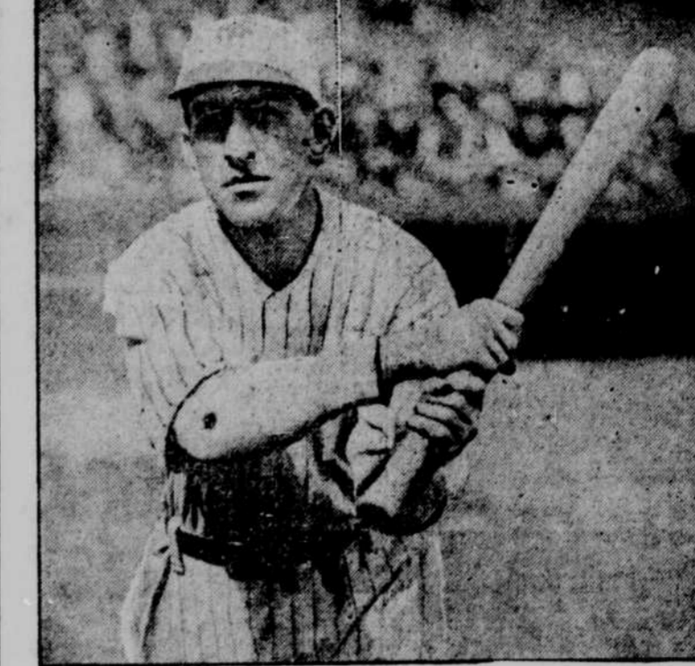
Roger Peckinpaugh proved himself a hero in yesterday's world series 1 to 1 when he slammed the ball for two bases scoring Judge, who had previously walked, with the winning run in the ninth inning.