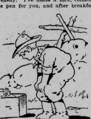
"I thought I'd catch you, Mr. Possum," said he.

Farmer Brown's Boy Gets a Shock. The first thing that Farmer Brown's Boy did the next morning after setting the trap for Unc' Billy Possum was to go look at the trap. He wasn't the least bit surprised to find that the trap had been sprung. In fact, he would have been surprised to have found it not sprung. A broad grin wrinkled up the freckles on his face.