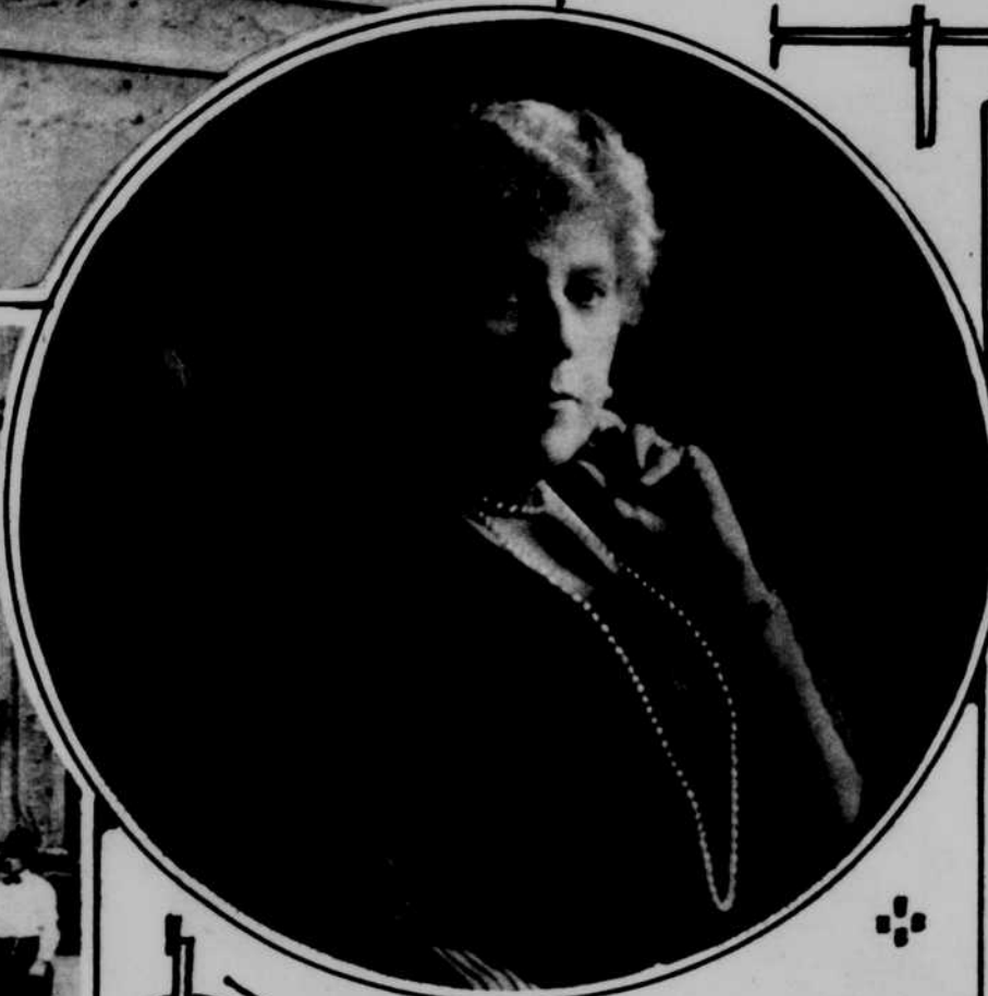
A new and heretofore unpublished portrait of Princess Beatrice, aunt of the King of England and mother of Queen Victoria