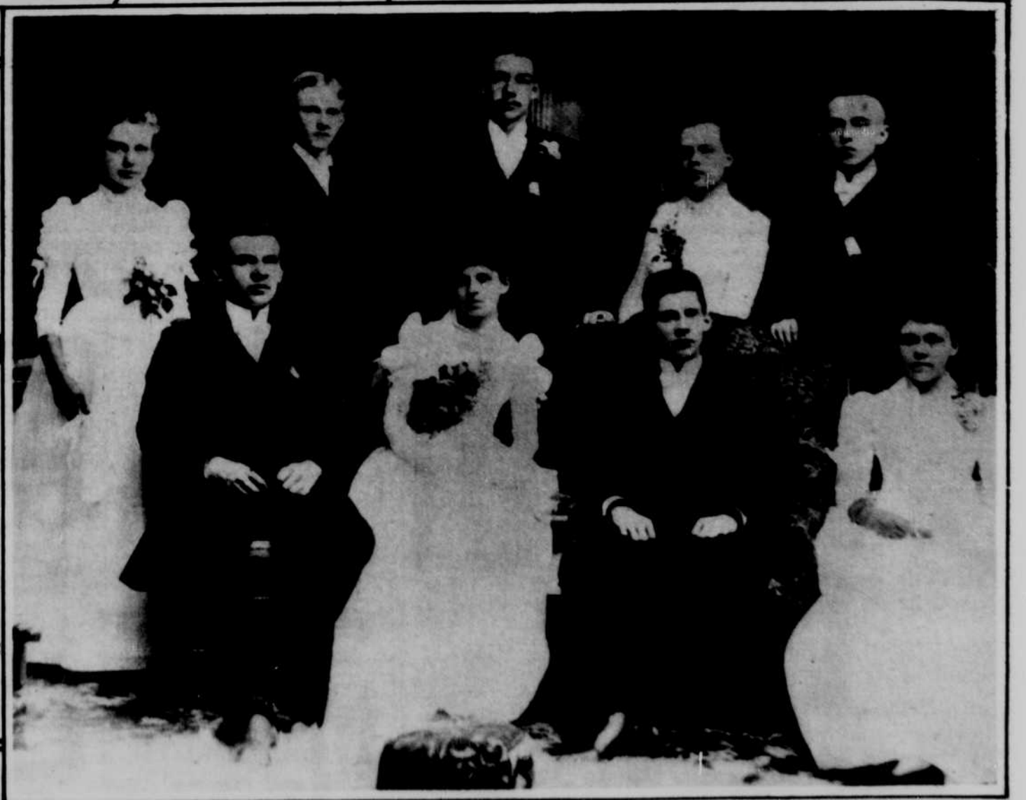
The only known photograph in existence of President Coolidge graduating from the Black River Academy at Ludlow, Vt. The President is standing second from left.