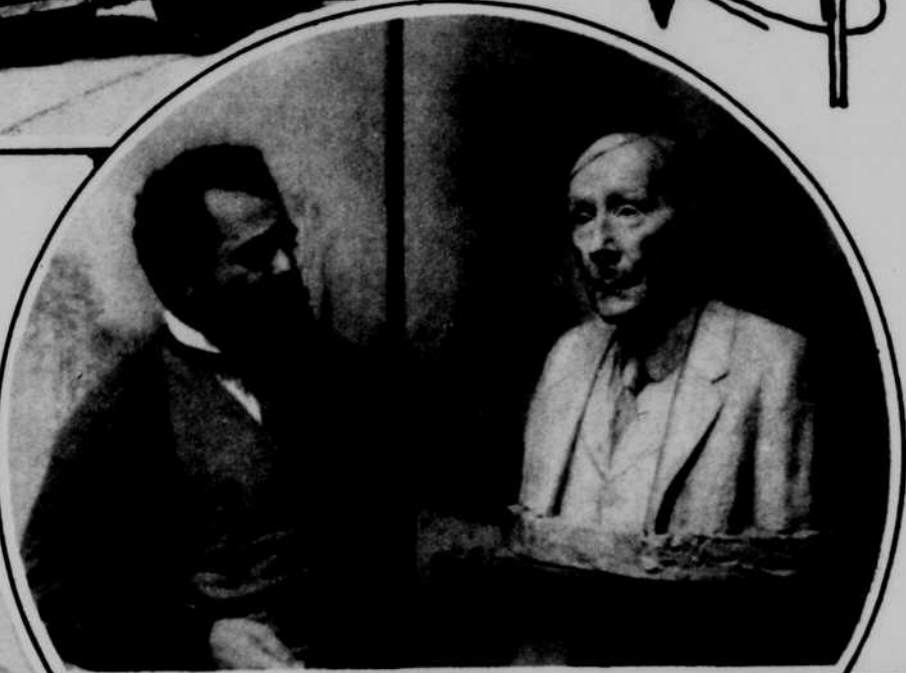
LEFT—Jo Davidson, the well known sculptor and his bust of John D. Rockefeller, which he executed on a recent visit in the United States and which he is exhibiting at his studio in Paris.