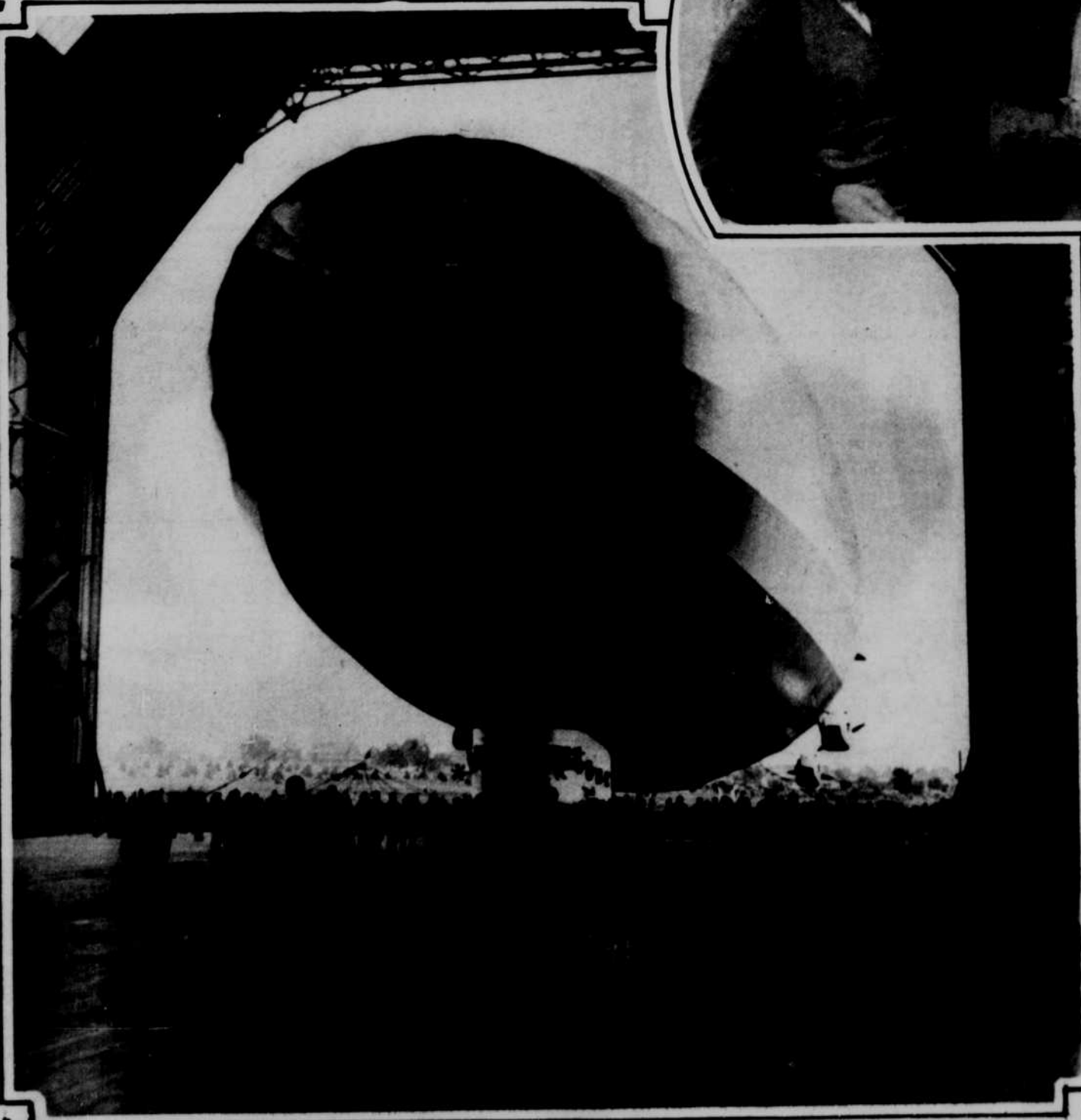
The giant dirigible, ZR-3, built for the United States at the Zeppelin factory at Friedrichshafen, Germany.