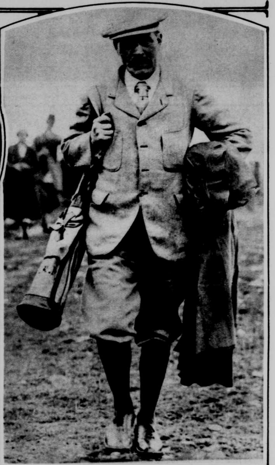
Ramsay Macdonald, the British Prime Minister who was excluded from the Lossiemouth Course, because of pacifist sentiments several years ago, plays a round with his son at Spey Bay, where he was more welcome.