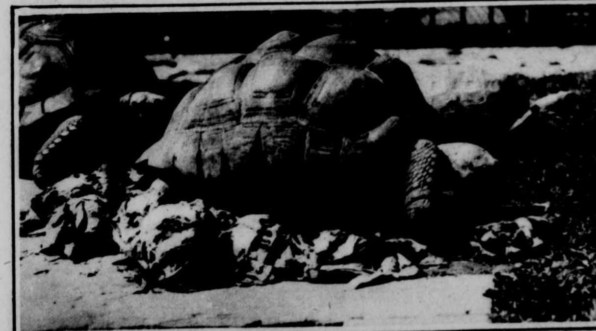
This giant tortoise at the London Zoo demonstrates that "Might is right" in commanding rations by laying on cabbages until he has had all that he can consume, other occupants of the cage being compelled to wait until he has finished for their meal.