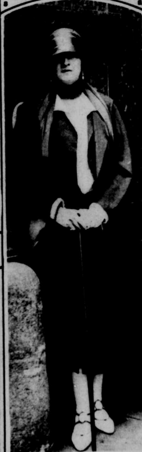
Elizabeth, former Queen of Greece, who went into exile with her husband, King George, recently arrived in London.

STYLE WITHOUT EXTRAVAGANCE HERZBERGS 1519 1521 DOUGLAS ST