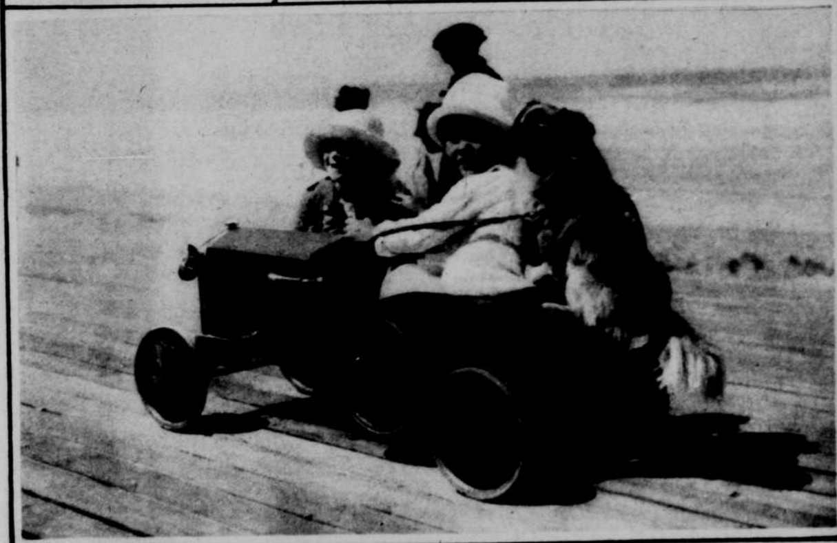
"The Speed King" of the boardwalk at Deauville.—This tiny youngster has acquired that title at the fashionable French resort where he is shown taking his Pekinese pet for a spin in his high powered velo-car.