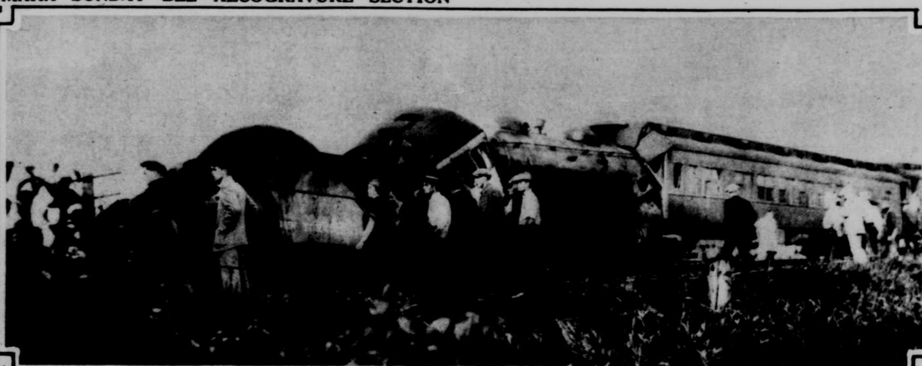
Fliers wrecked near Syracuse.—The Detroit, crack limited from New York to Detroit, passed caution and stop signals, as well as flagman's warning, and crashed into the rear of the Lake Shore Limited, halted by a broken air line. The wreck occurred recently at Savannah, 30 miles west of Syracuse, in a heavy fog.