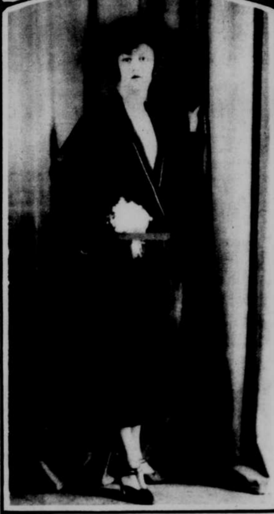
Displacing the custom of a corsage.—On this new Paris gown there is embroidered a corsage of violets. This may be a further indication of the well known French thrift, and at any rate it has been offered in Paris, and is gaining favor.