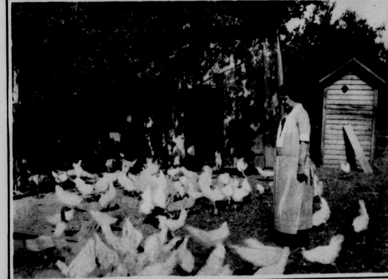
Mrs. Miriam F. Ferguson of Texas, who has a good chance to become first woman Governor in the United States.