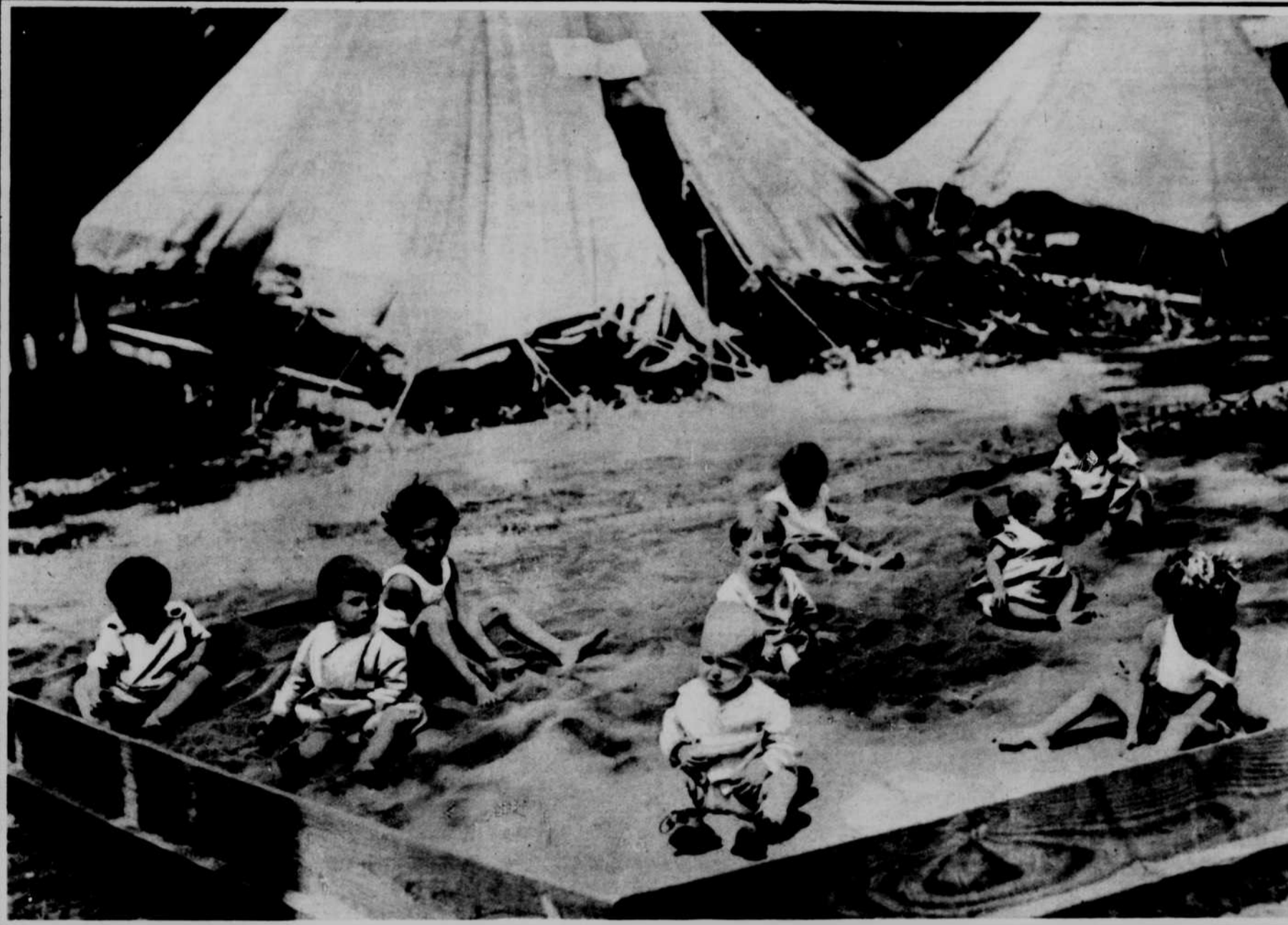
Camp Good Will, at Washington, D. C., where the poor kiddies of the National Capitol city are cared for through the hot summer months.