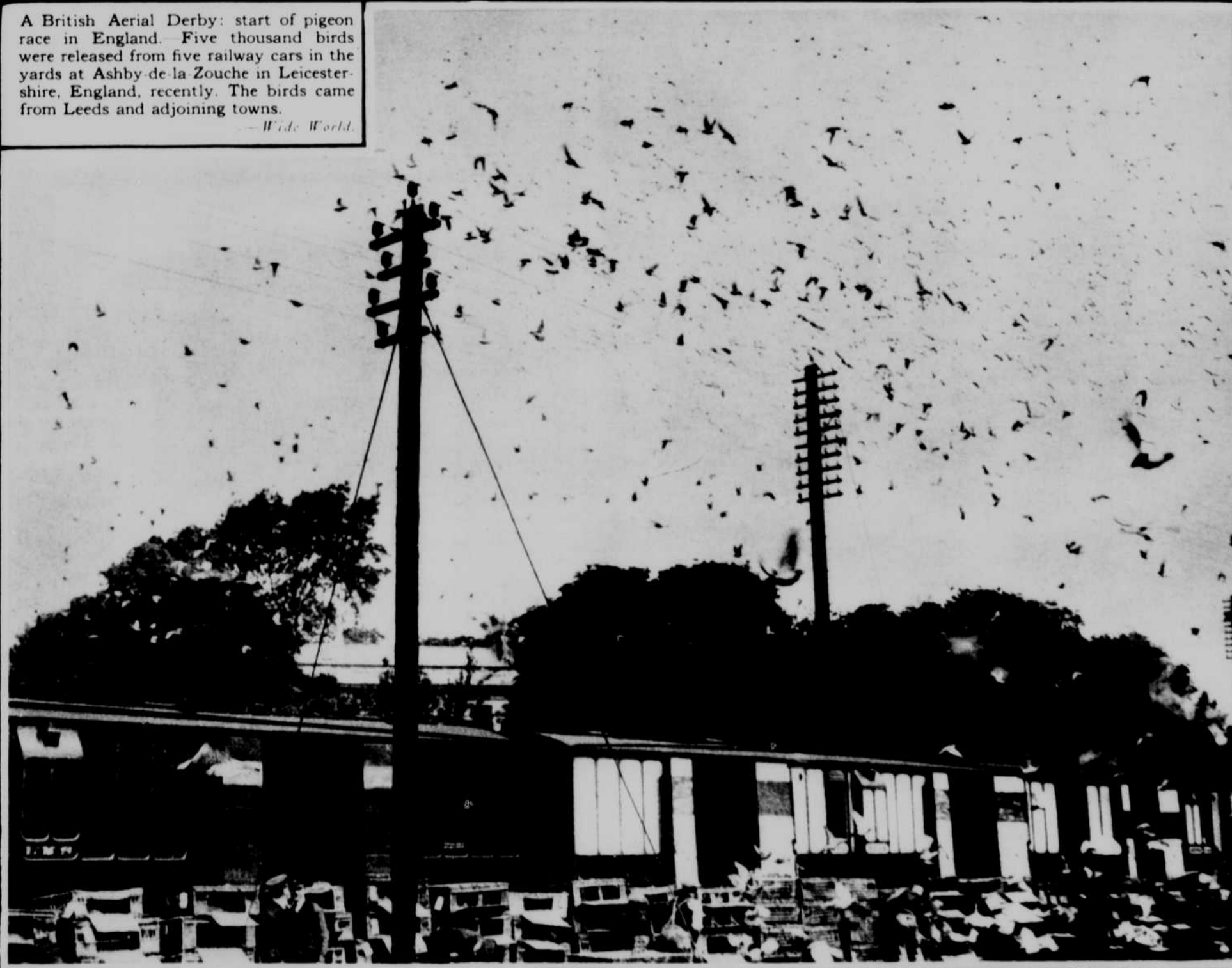
A British Aerial Derby: start of pigeon race in England. Five thousand birds were released from five railway cars in the yards at Ashby-de-la Zouche in Leicestershire, England, recently. The birds came from Leeds and adjoining towns.