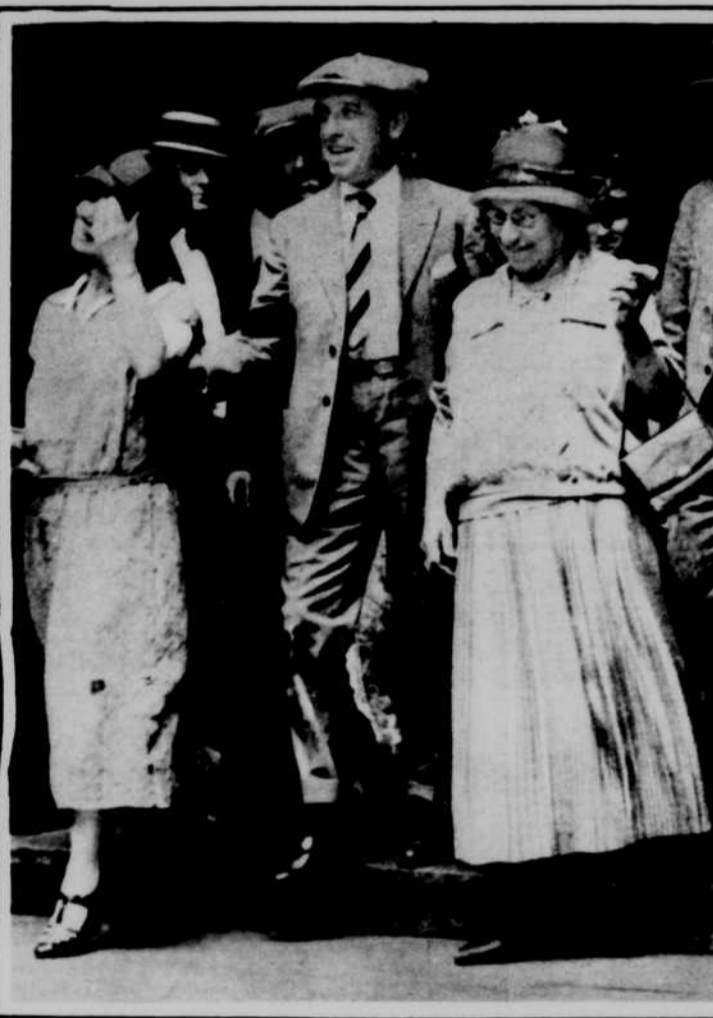
Charles Ponzi, whose financial scheme brought him a Federal sentence about four years ago finishes his sentence of the Government and is now out on bail of $14,000 pending his trial in the Suffolk County, Mass., courts.