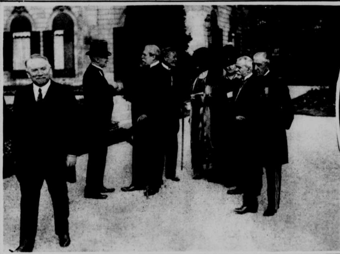
President Doumergue in the left foreground, after receiving Secretary of State Hughes, Ambassador Herrick and members of the American Bar Association at the Elysee Palace.