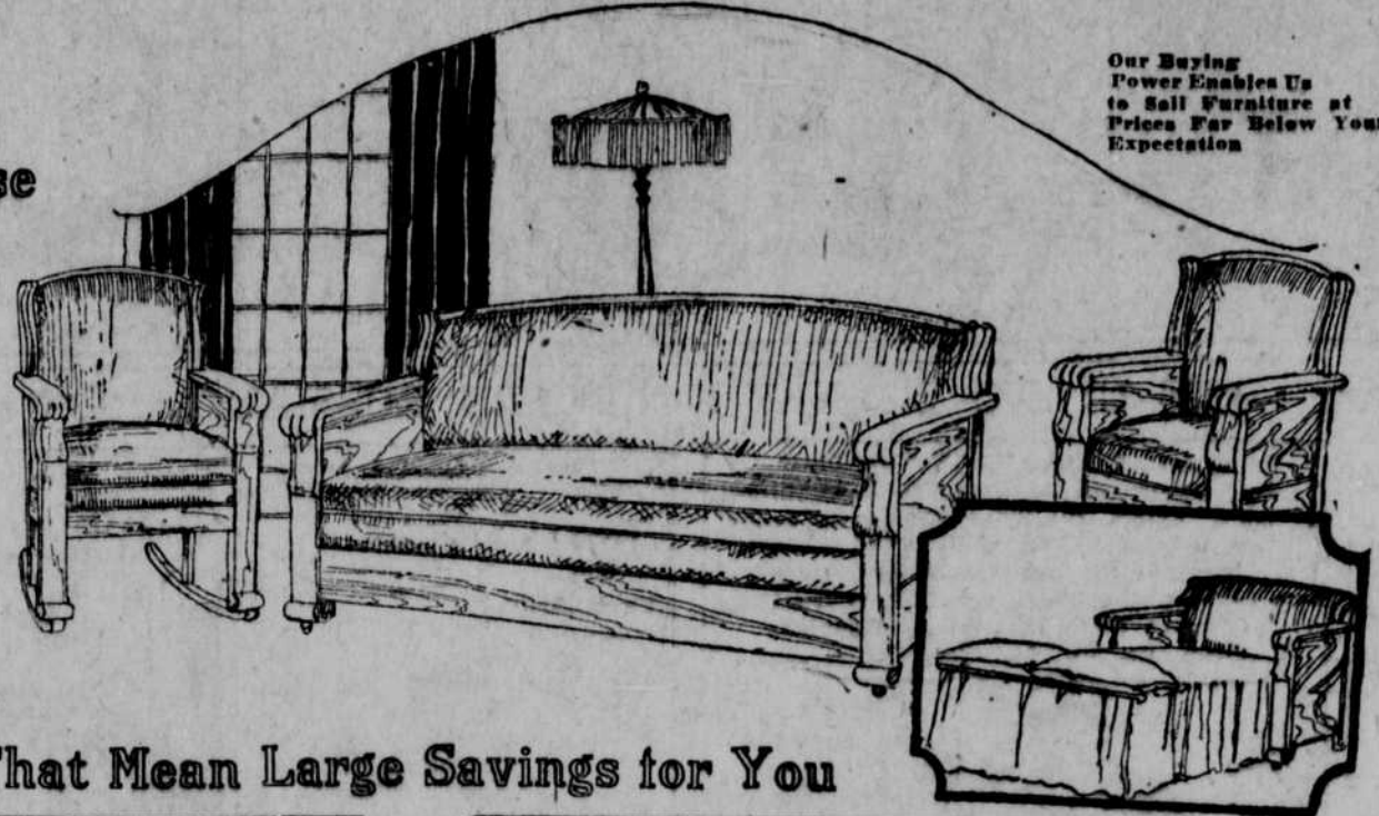
Our Buying Power Enables Us to Sell Furniture at Prices Far Below Your Expectation