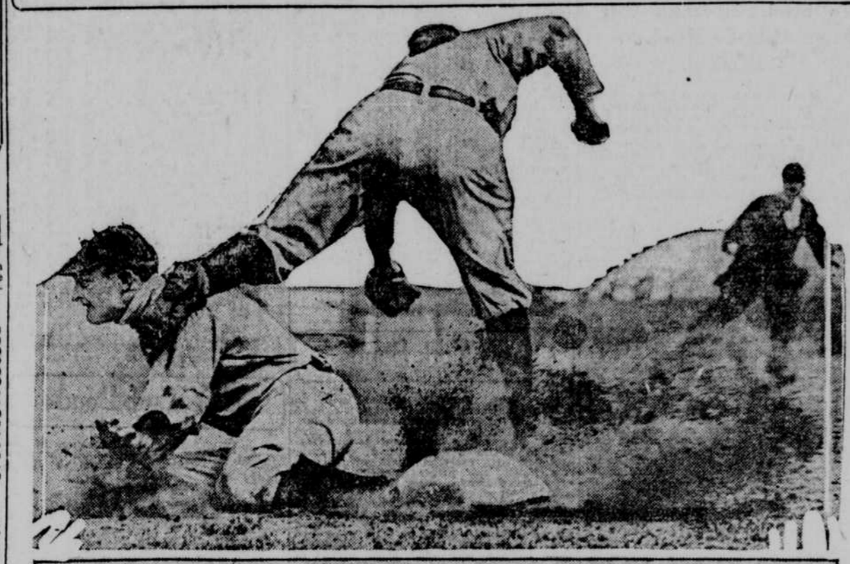
SLIDE, TY, SLIDE!

This remarkable action photograph shows Ty Cobb, manager of the Detroit Tigers, now fighting for first place in the American league, sliding into third base.