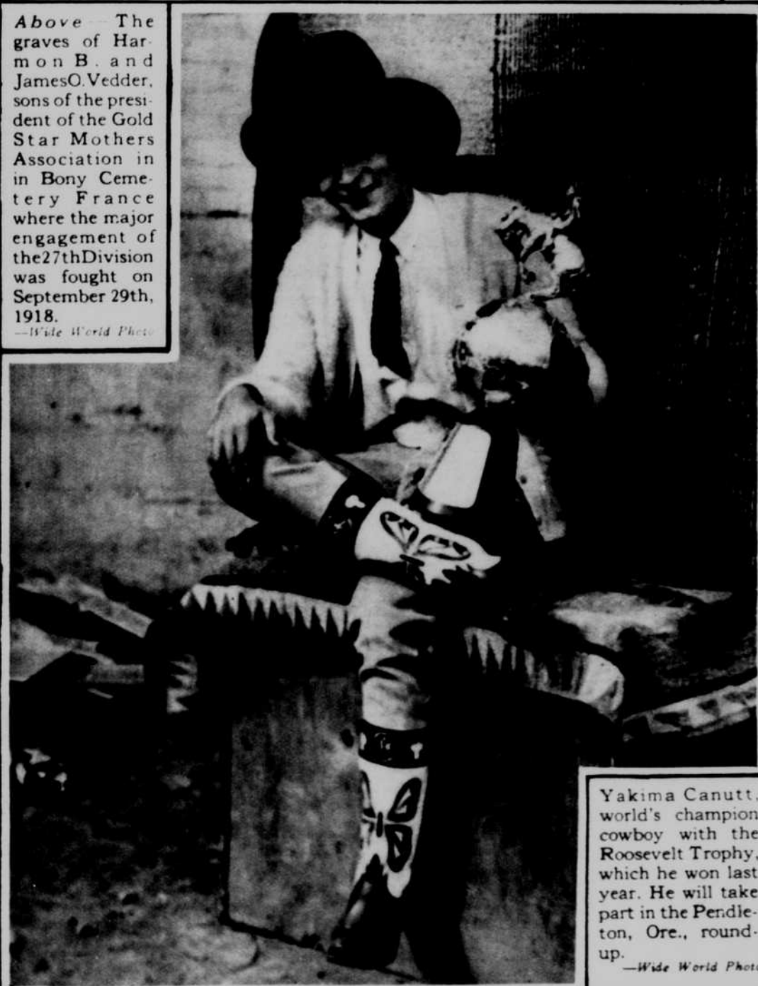
Yakima Canutt, world's champion cowboy with the Roosevelt Trophy, which he won last year. He will take part in the Pendleton, Ore., round-up.