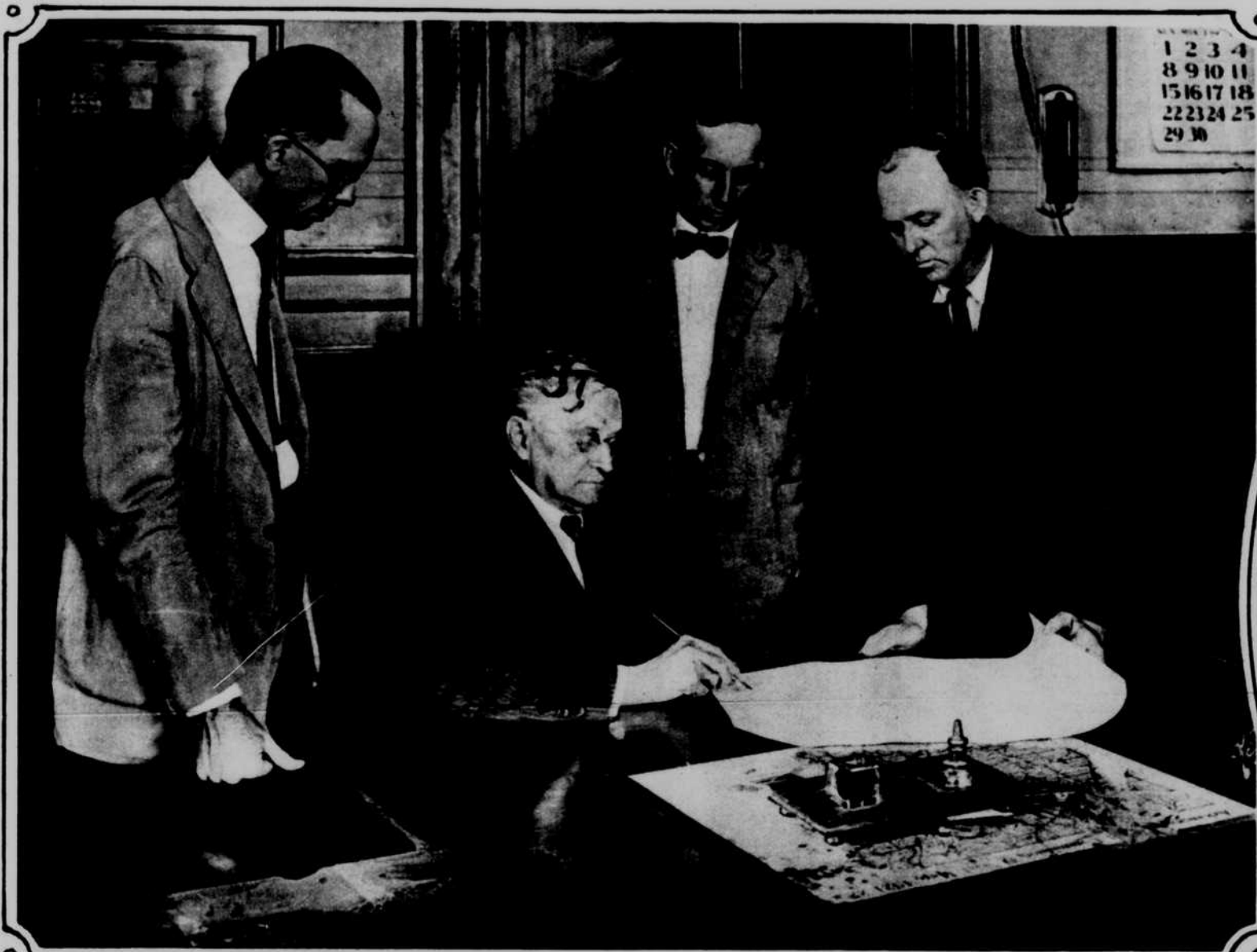
Governor McRae of Arkansas signing the child labor bill ratifying the amendment to the Federal Constitution. Arkansas has the distinction of being the first state to enact legislation to ratify this amendment.