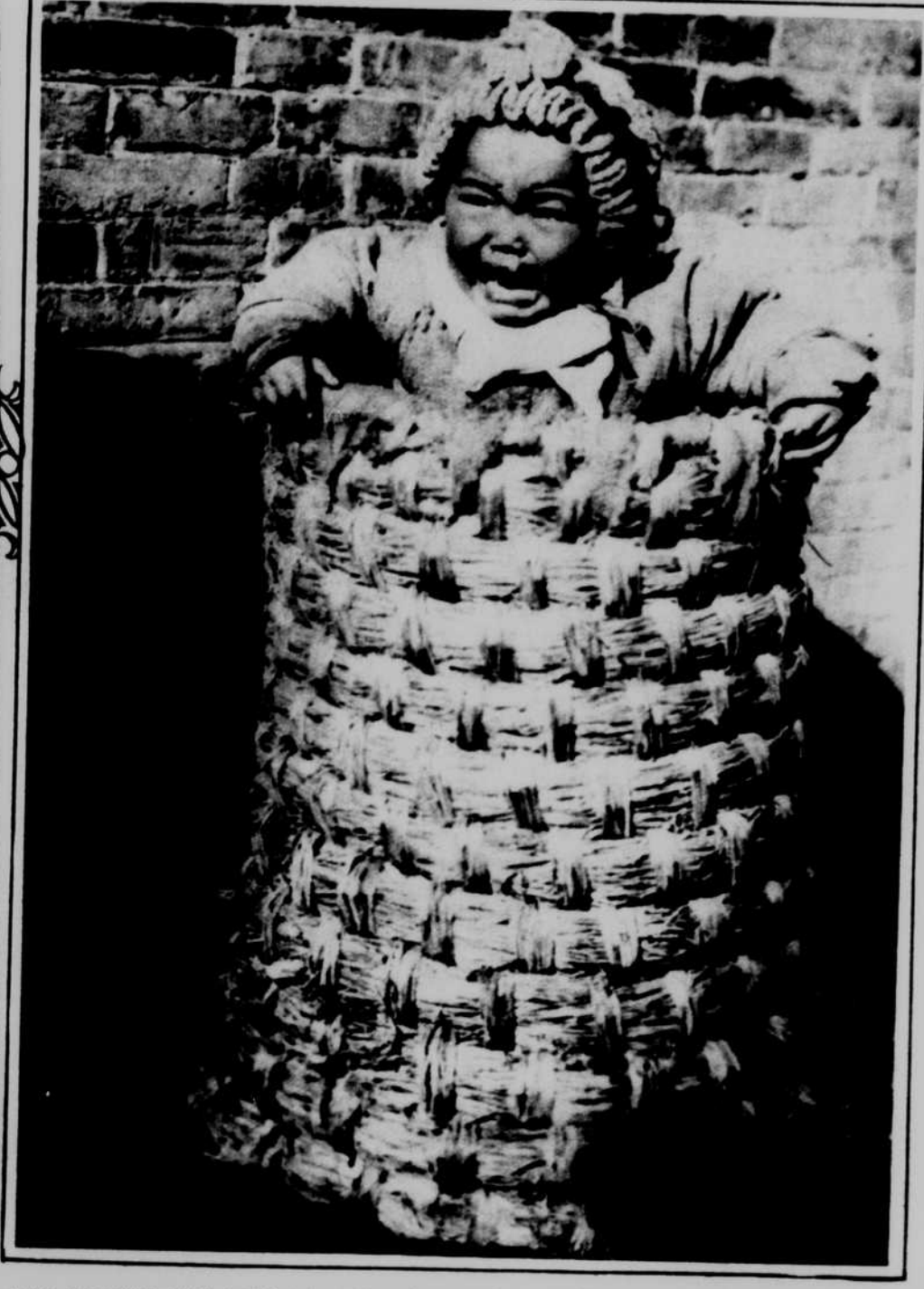
FOR CRYING OUT LOUD! In China they used a peculiar straw contrivance to keep the babies from running away—but sometimes they don't like it. Evidently this one does not.