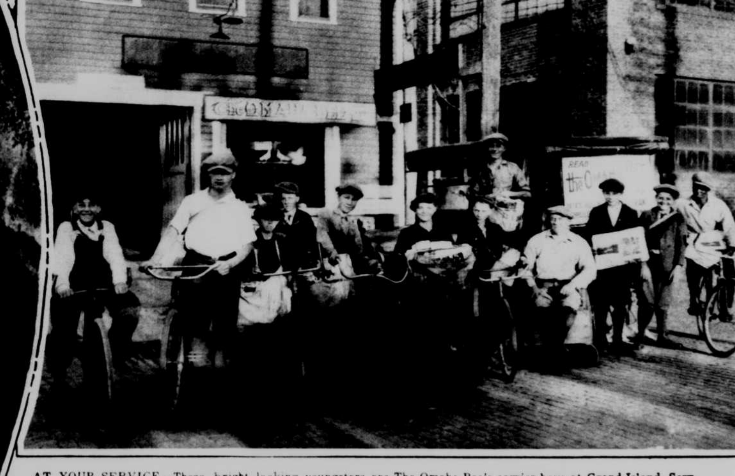
AT YOUR SERVICE-These bright looking youngsters are The Omaha Bee's carrier boys at Grand Island. Service is their middle name.

source, and so dug his nose into the rock's crevice from which it came. P. &