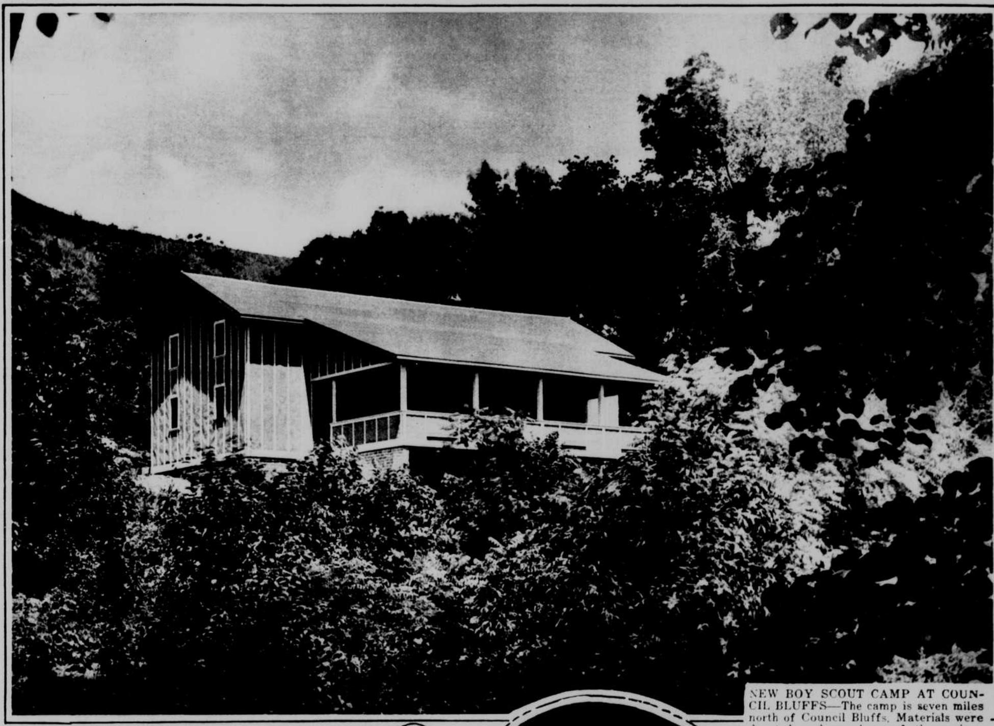
NEW BOY SCOUT CAMP AT COUN-CIL BLUFFS—The camp is seven miles north of Council Bluffs, Materials were donated and members of the various Bluffs labor unions gave their services in constructing the building. The camp will remain open the year round.