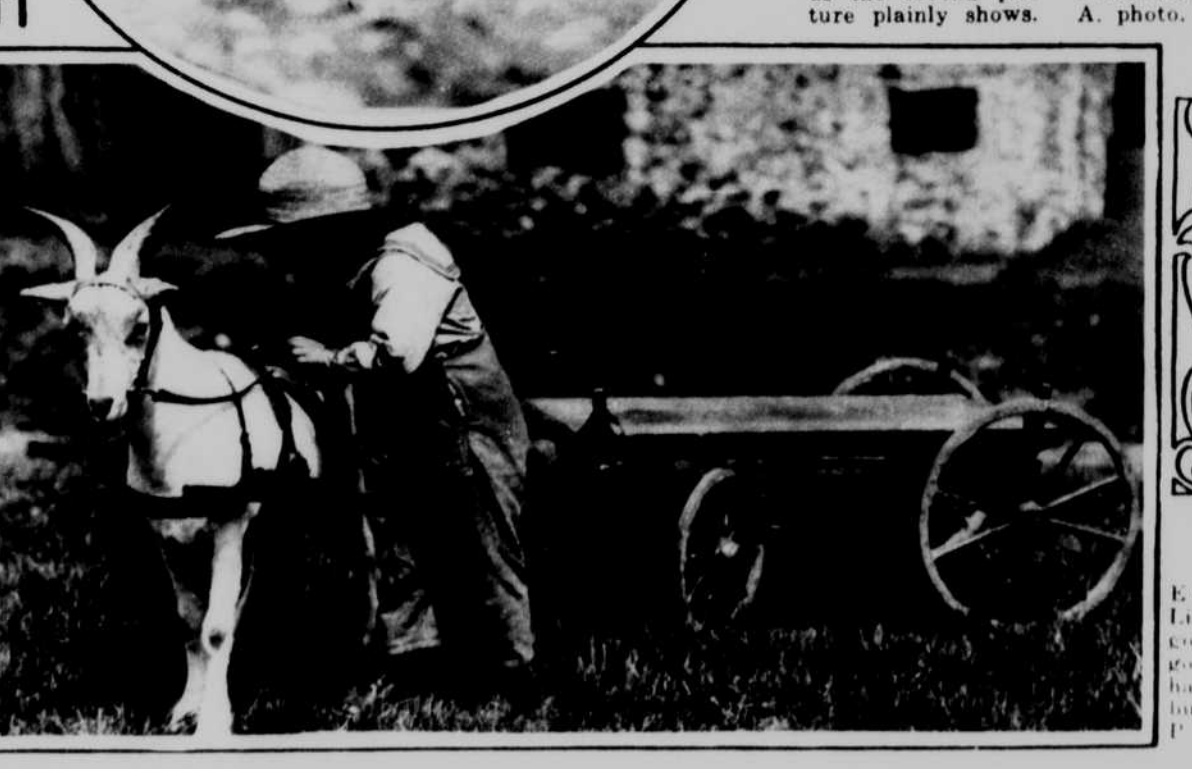
ONOMICAL TRANSPORTATIONimousines may came and sport models may o, but there is no joy like that of the billy that wagon of childhood. This youngster is avong some slight trouble with the harness. it it won't matter when he gets started