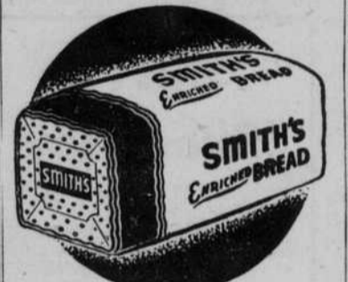
The Bread You Need for Energy

Since 1871 . . . The First National Bank of Lincoln Lincoln, Nebraska Member Federal Deposit Insurance Corporation