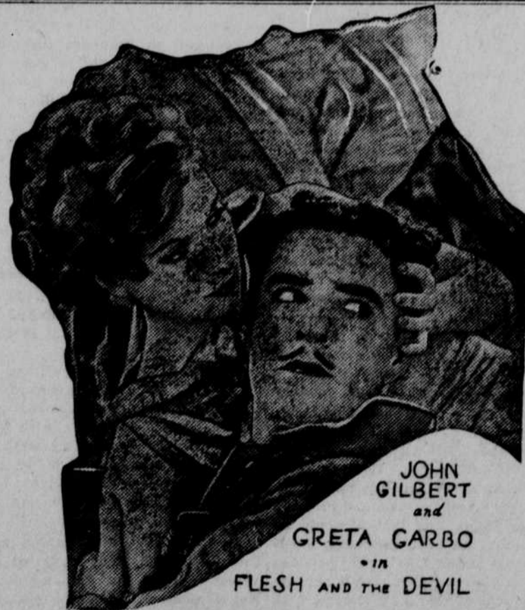
JOHN GILBERT and GRETA GARBO in FLESH AND THE DEVIL

The Church With a Welcome and a Message, Come