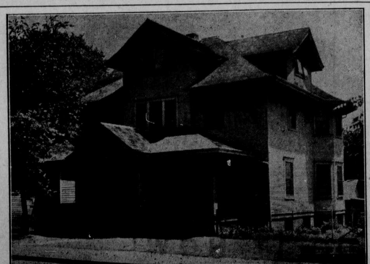
The Residence the N. W. C. A. Is Raising Funds to Buy for Old Folks' Home .- Have You Done Your Share?

Short, timely letters are invited. We prefer that writers sign: their names, but in all cases letters signed with a nom de plume or as "Reader," "Subscriber," etc., must be accompanied by the name and address of the author for the editor's information.