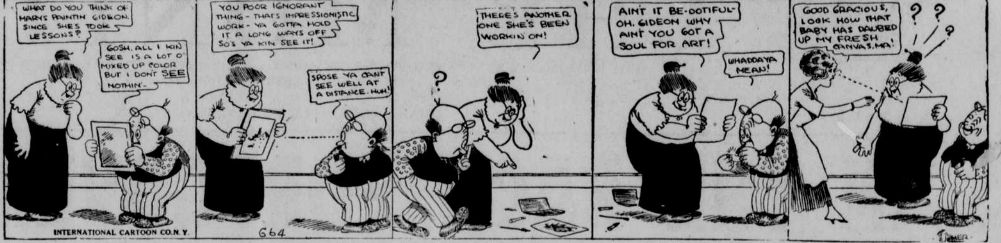
Raising the Family - Ma's imagination is greater than her eye for art