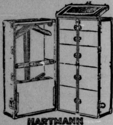
HARTMANN Most Useful Because Most Practical

It is impossible for us to offer or suggest a more appropriate gift than a Hartmann Wardrobe Trunk for Christmas.