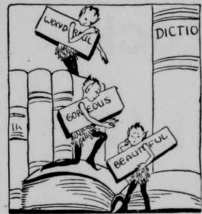
"Just a Little Upset."

"We don't try to be mean or horrid or ugly. But we've been feeling badly because no one seemed to like us. We