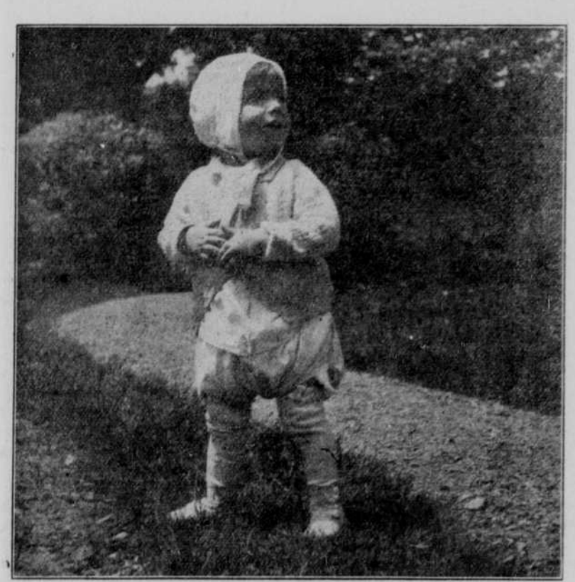
OUT FOR A ROMP