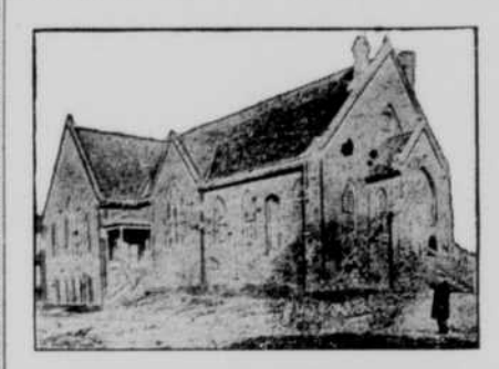
GROVE METHODIST CHURCH 22nd and Seward Sts., Omaha, Neb.