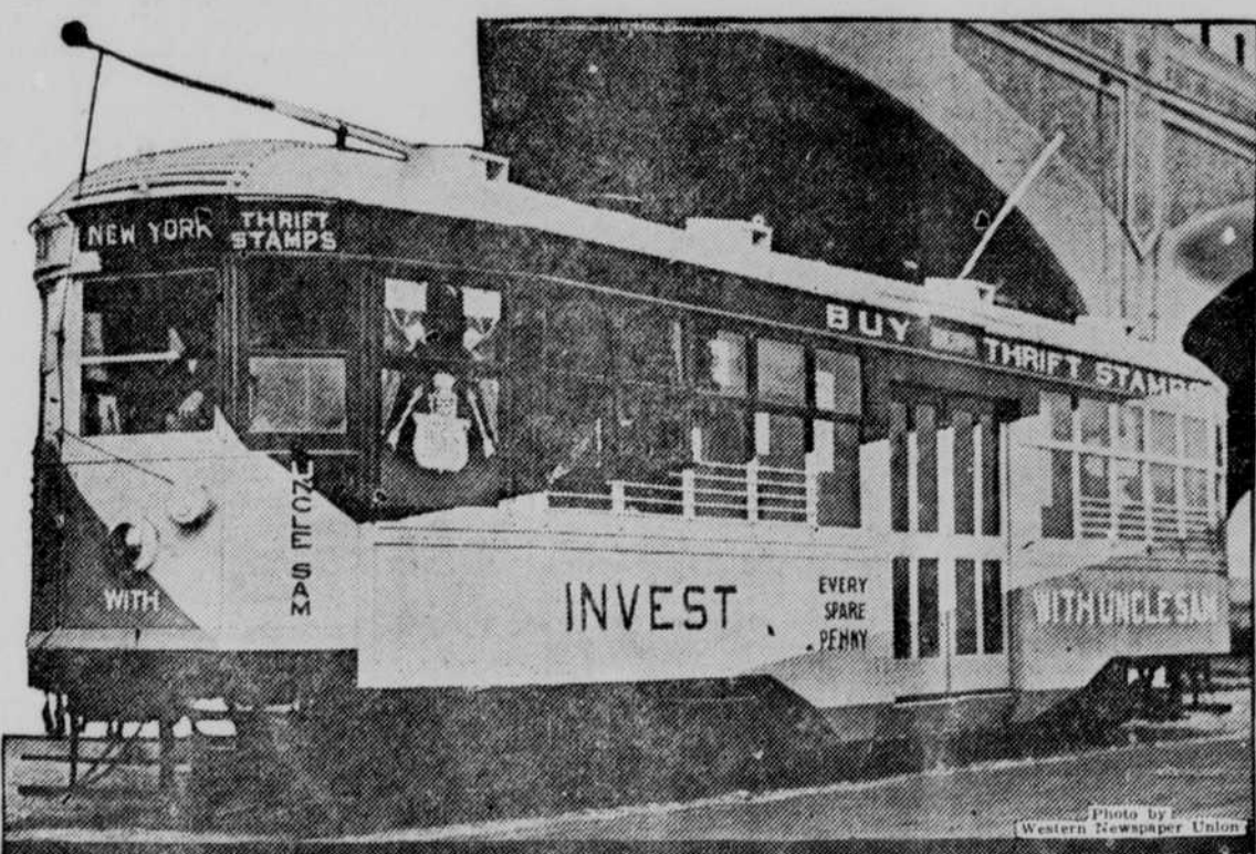
Here is one of the Thrift Stamp cars, painted red, white and blue, that are being operated on the line between Jamaica, L. I. and New York. The conductors are getting good results as agents for the Thrift Stamps.