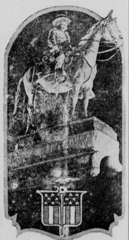
Statue of General Grant, in Lincoln Park, Chicago.

The quick ear of Grant beard commotion in the street. His voice that and cheered on the Boys in Blue at