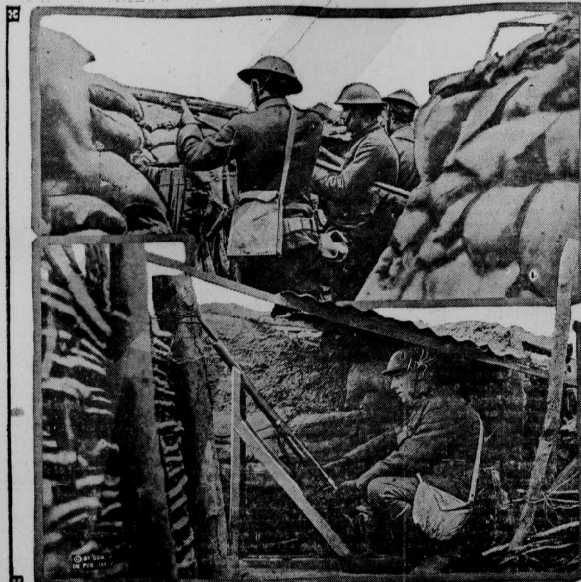
Here are two of the first pictures received in the United States showing our boys at the actual fighting from holding a portion of the Lorraine sector against the Teuton horde. At the top is shown a section of a trench held by American troops, and at the bottom a soldier ready to fire a signal rocket as a warning that a German attack has begun.