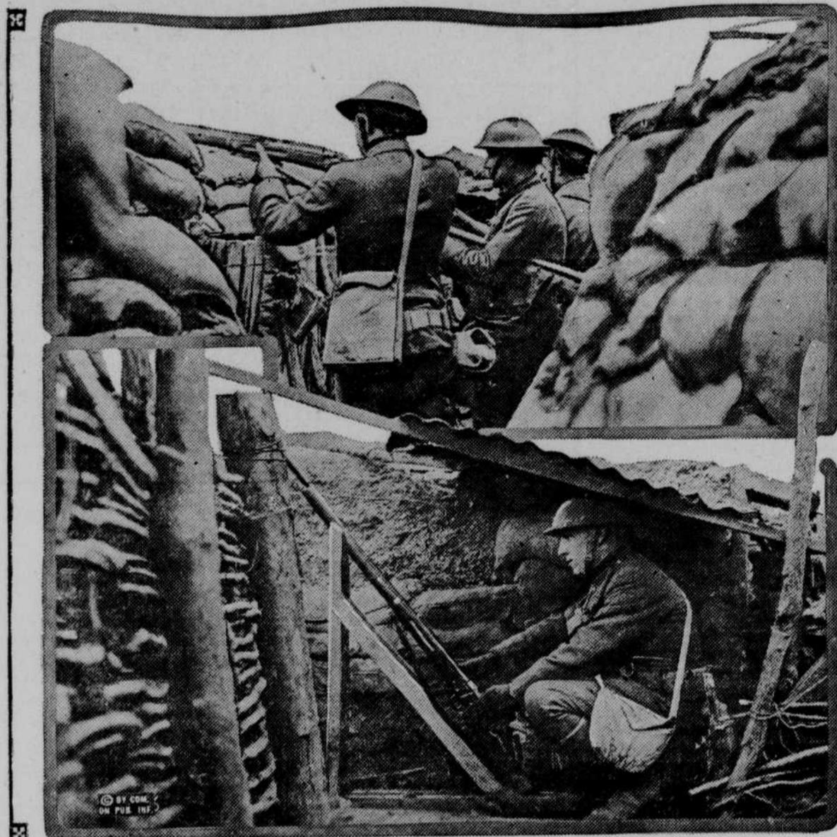
Here are two of the first pictures received in the United States showing our boys at the actual fighting from holding a portion of the Lorraine sector against the Teuton horde. At the top is shown a section of a trench held by American troops, and at the bottom a soldier ready to fire a rocket as a warning that an attack has begun.