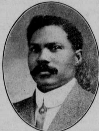
Omaha's Most Successful Barber.